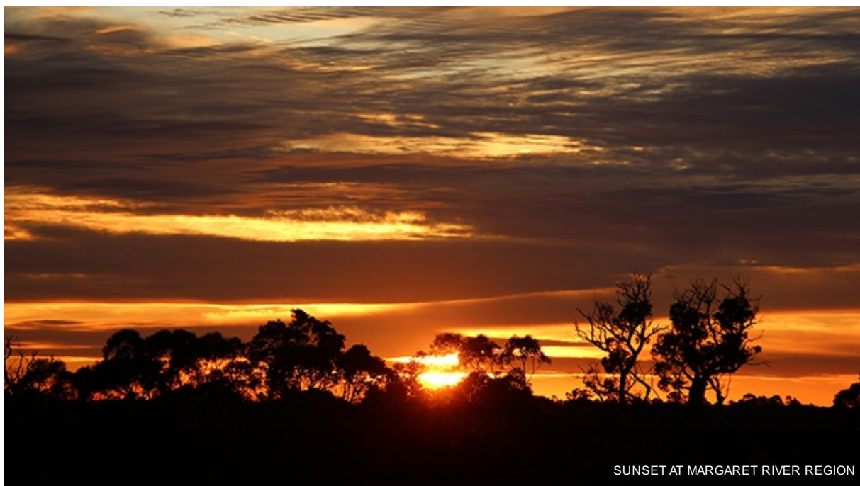
SUNSET AT MARGARET RIVER REGION