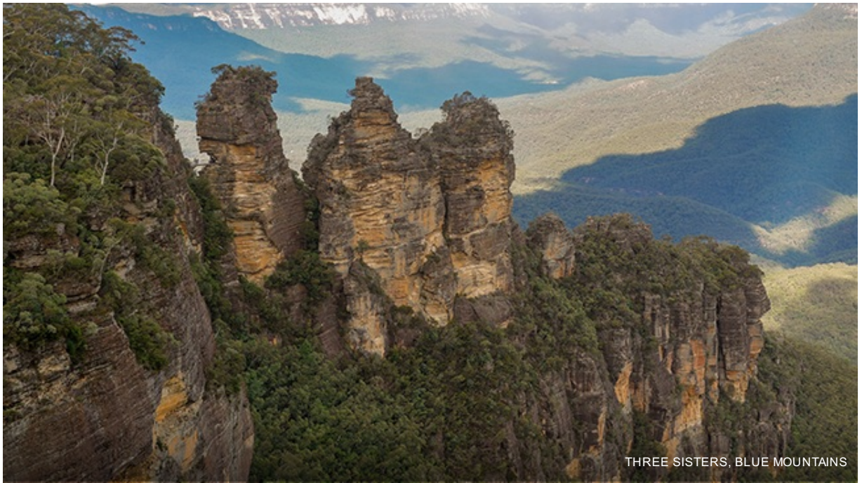
THREE SISTERS, BLUE MOUNTAINS