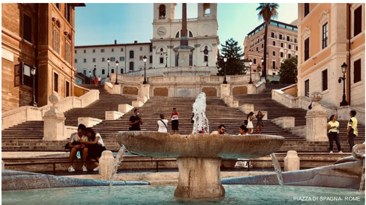
PIAZZA DI SPAGNA- ROME