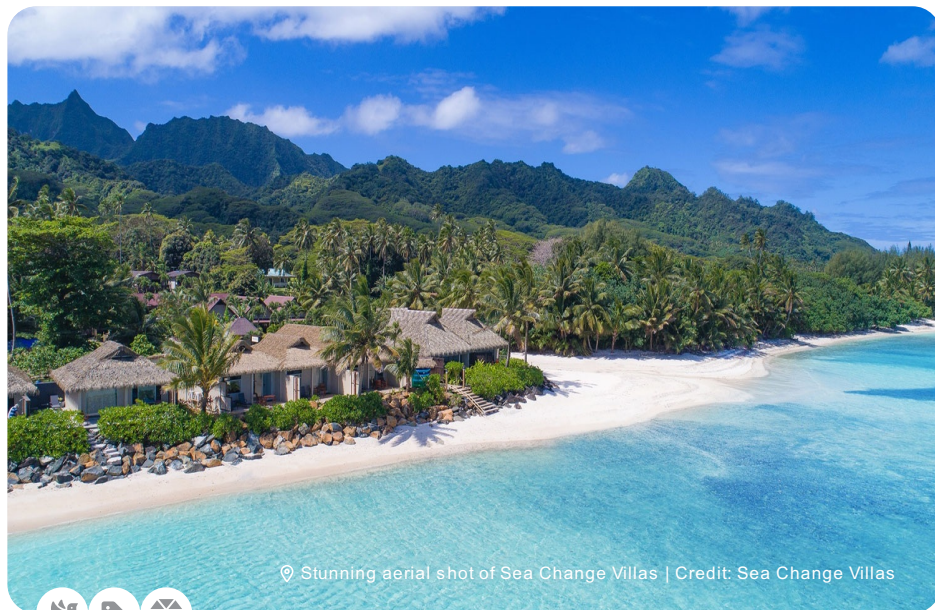
📍 Stunning aerial shot of Sea Change Villas