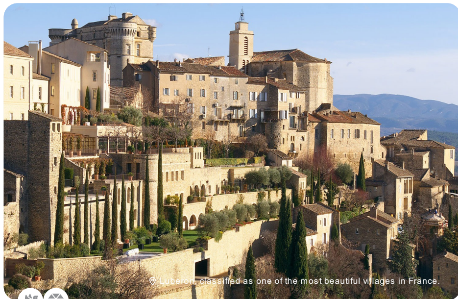
📍 Luberon, classified as one of the most beautiful villages in France.