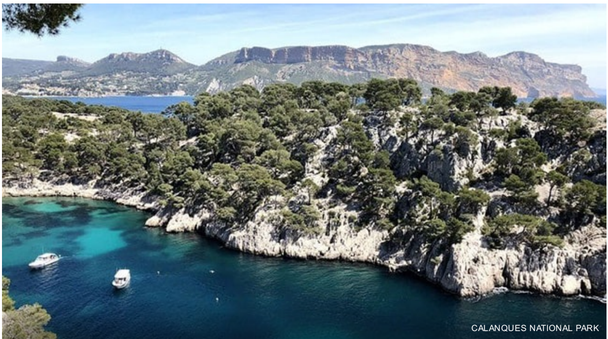
CALANQUES NATIONAL PARK