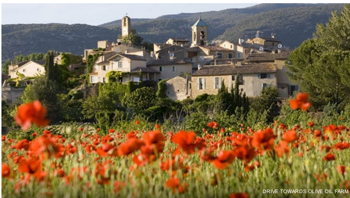
DRIVE TOWARDS OLIVE OIL FARM