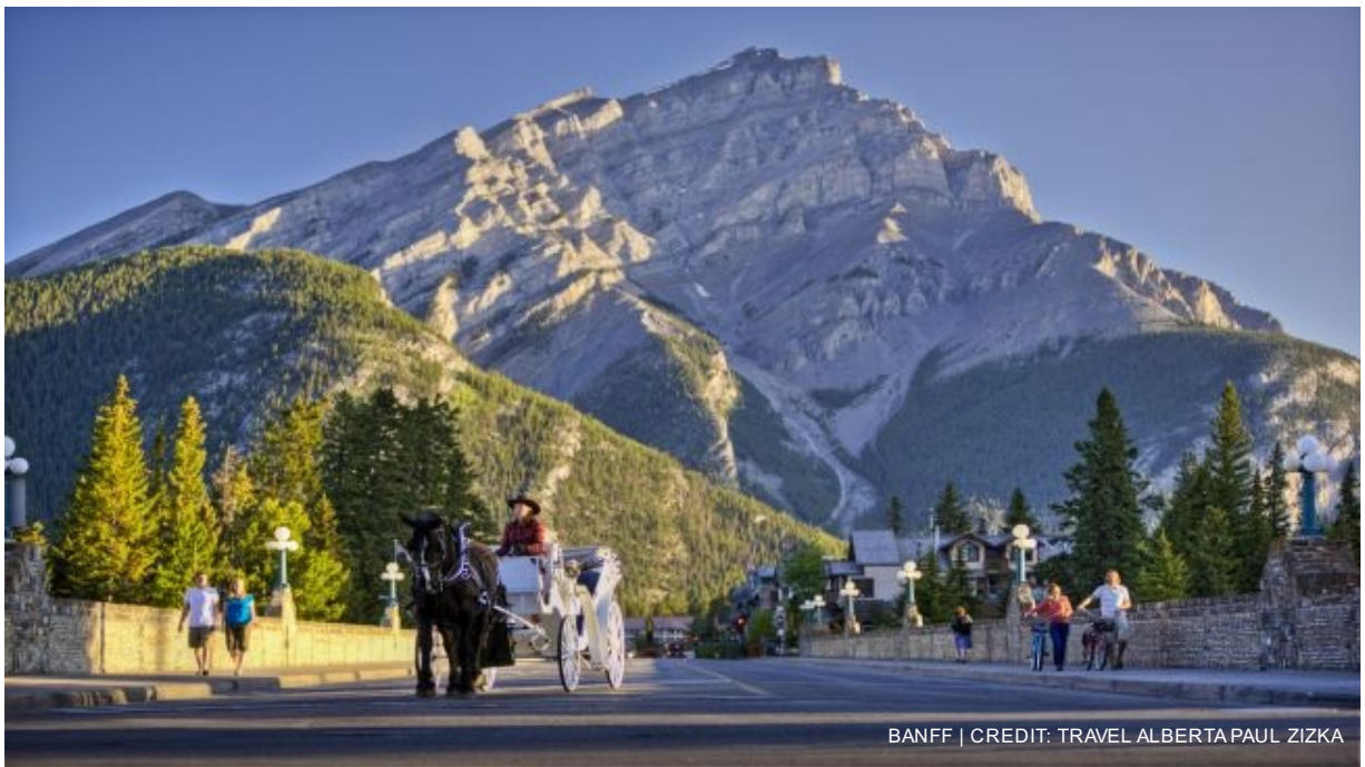
BANFF