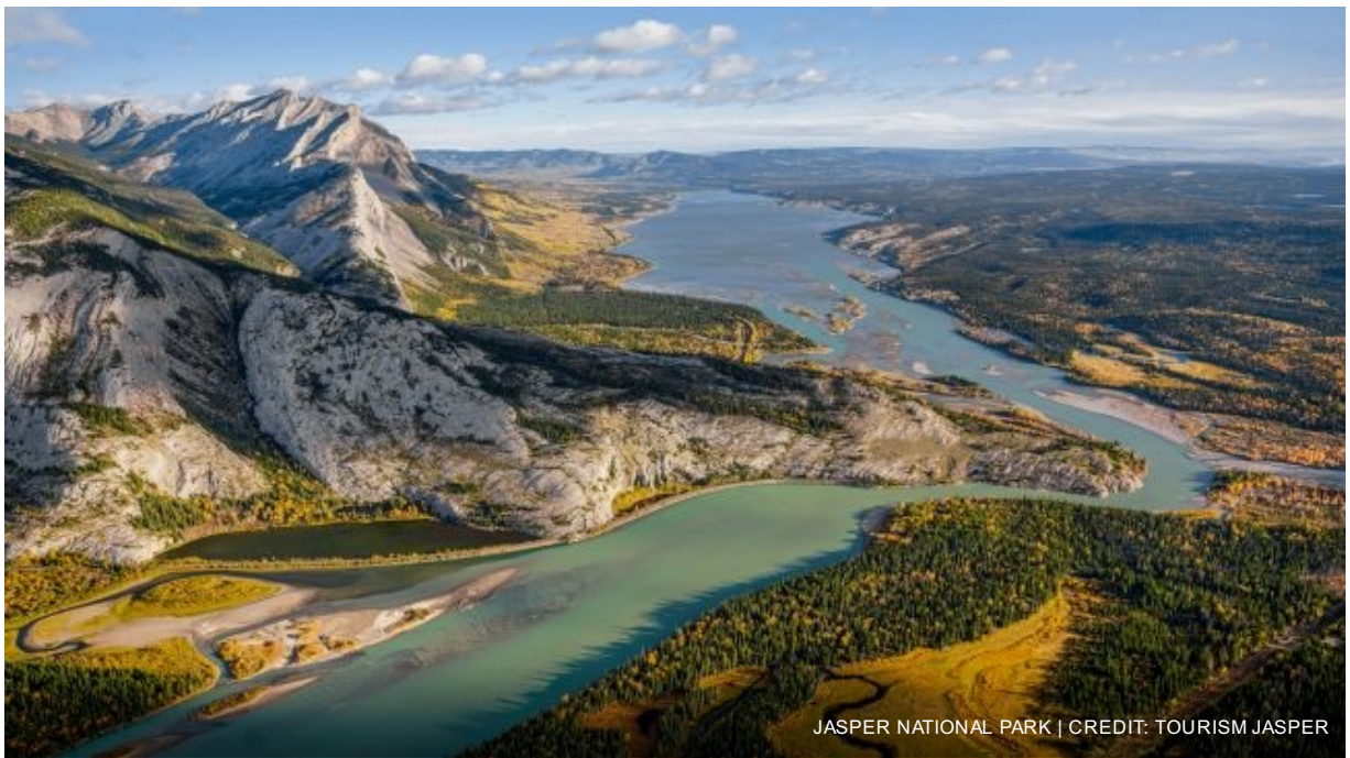
JASPER NATIONAL PARK