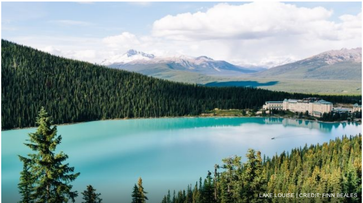
LAKE LOUISE

Overnight in Lake Louise at The Fairmont Chateau Lake Louise