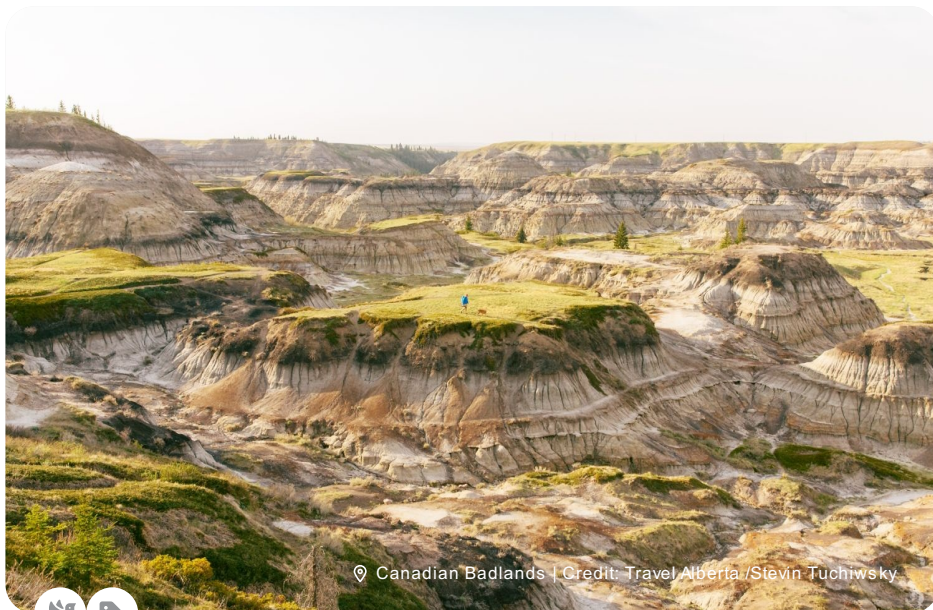
📍 Canadian Badlands