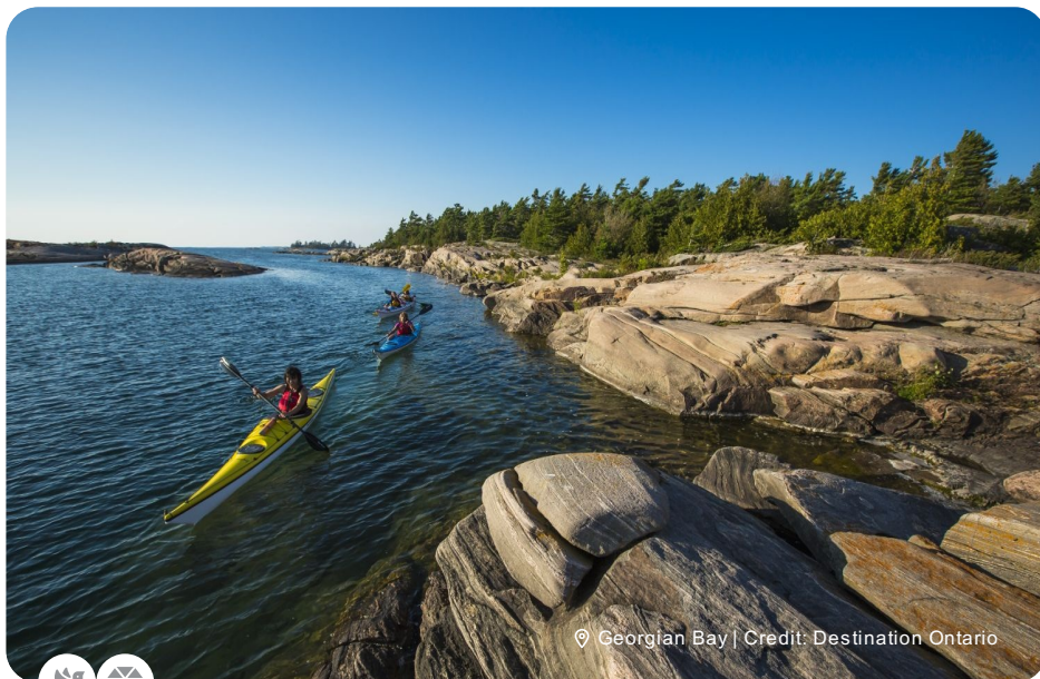
Georgian Bay