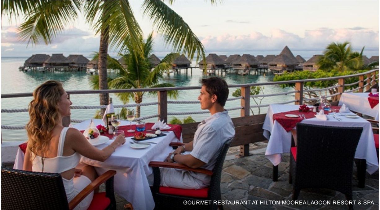
GOURMET RESTAURANT AT HILTON MOOREA LAGOON RESORT & SPA