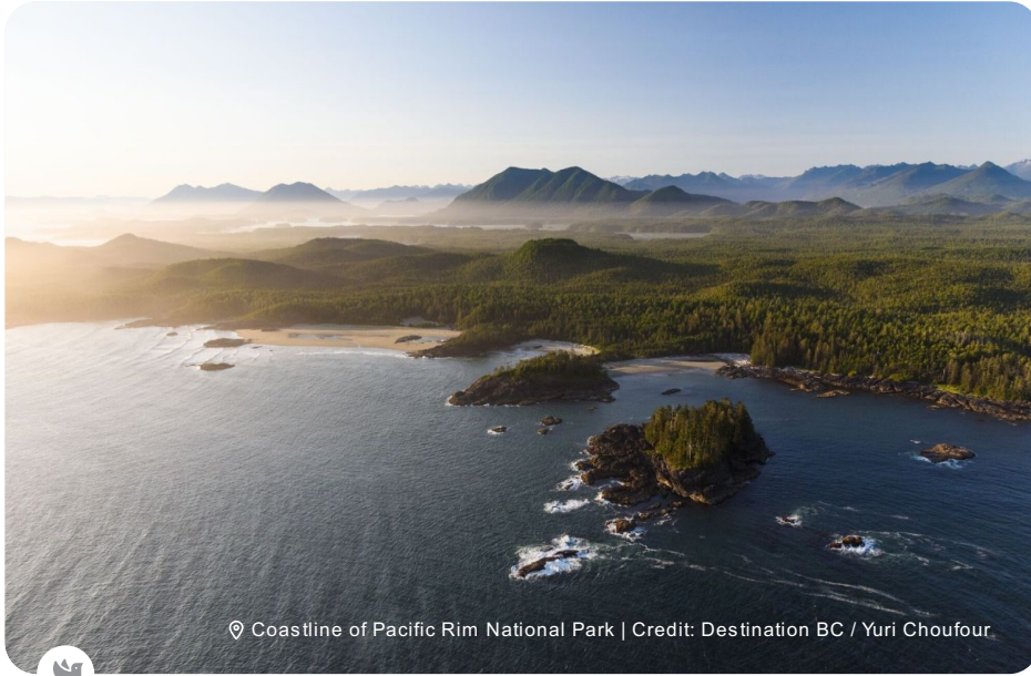
📍 Coastline of Pacific Rim National Park