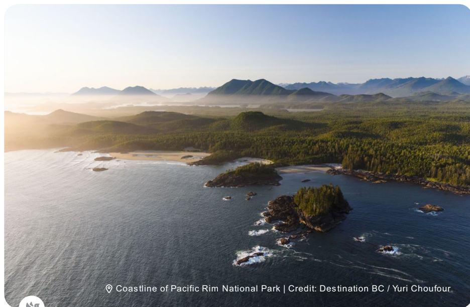
📍 Coastline of Pacific Rim National Park