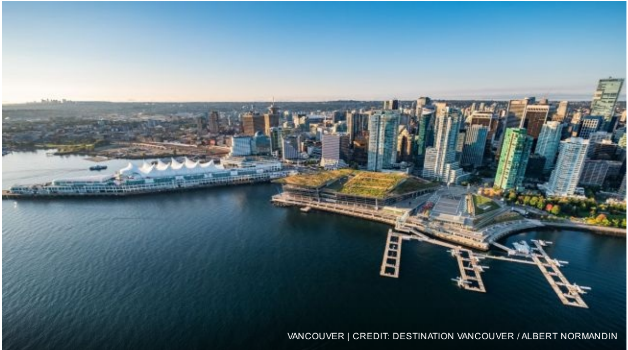
VANCOUVER

Overnight in Vancouver at the Sheraton Vancouver Wall Centre (or similar)