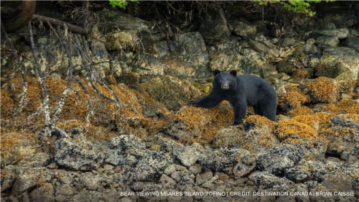
BEAR VIEWING MEARES ISLAND TOFINO

Overnight in Tofino at Pacific Sands Beach Resort (or similar)