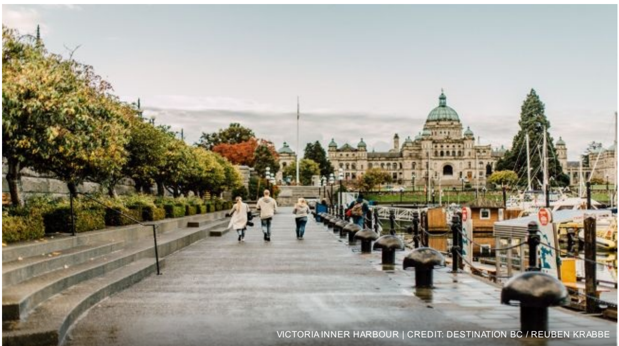
VICTORIA INNER HARBOUR

Overnight in Victoria at the Inn at Laurel Point (or similar)