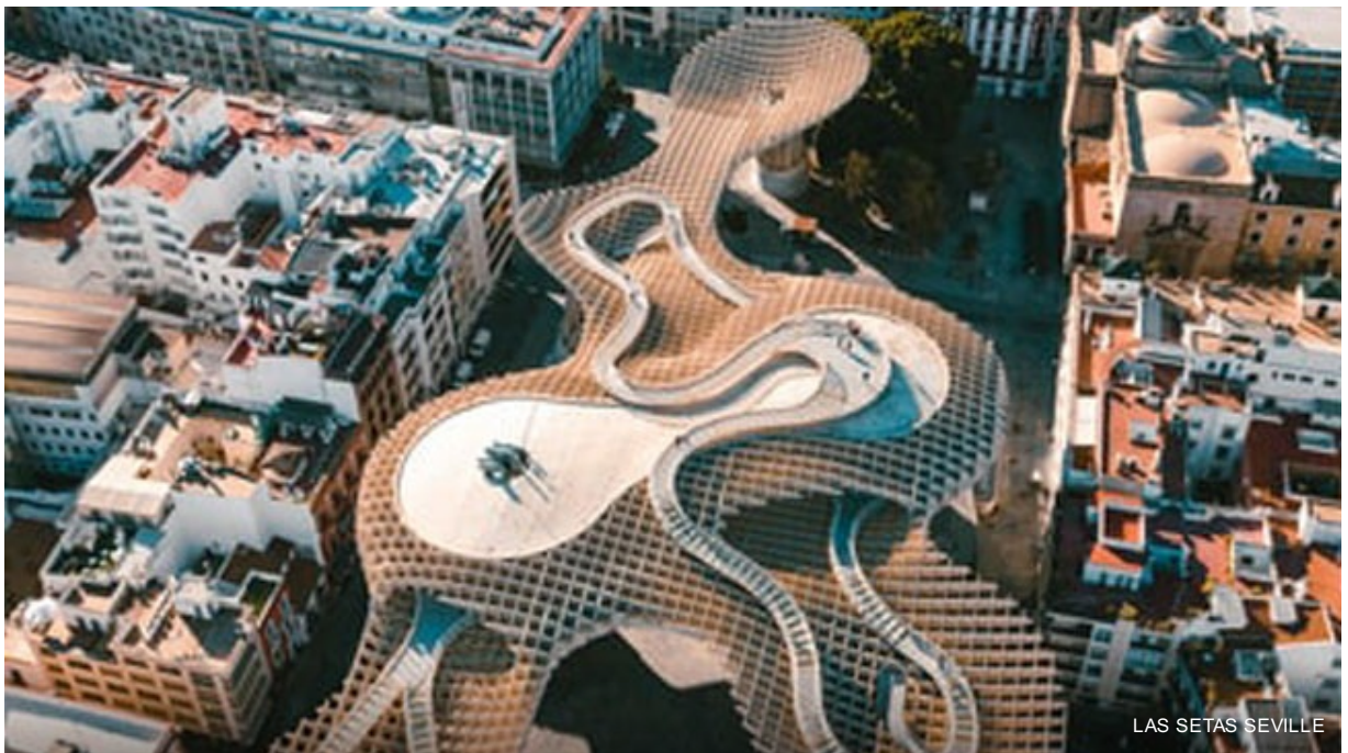
LAS SETAS SEVILLE