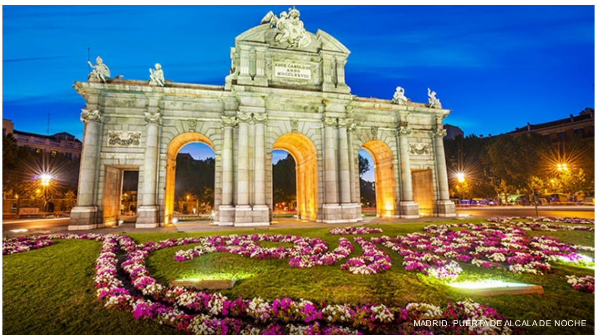
MADRID. PUERTA DE ALCALÁ DE NOCHE

Overnight stay in Madrid at Barcelo Torre Madrid