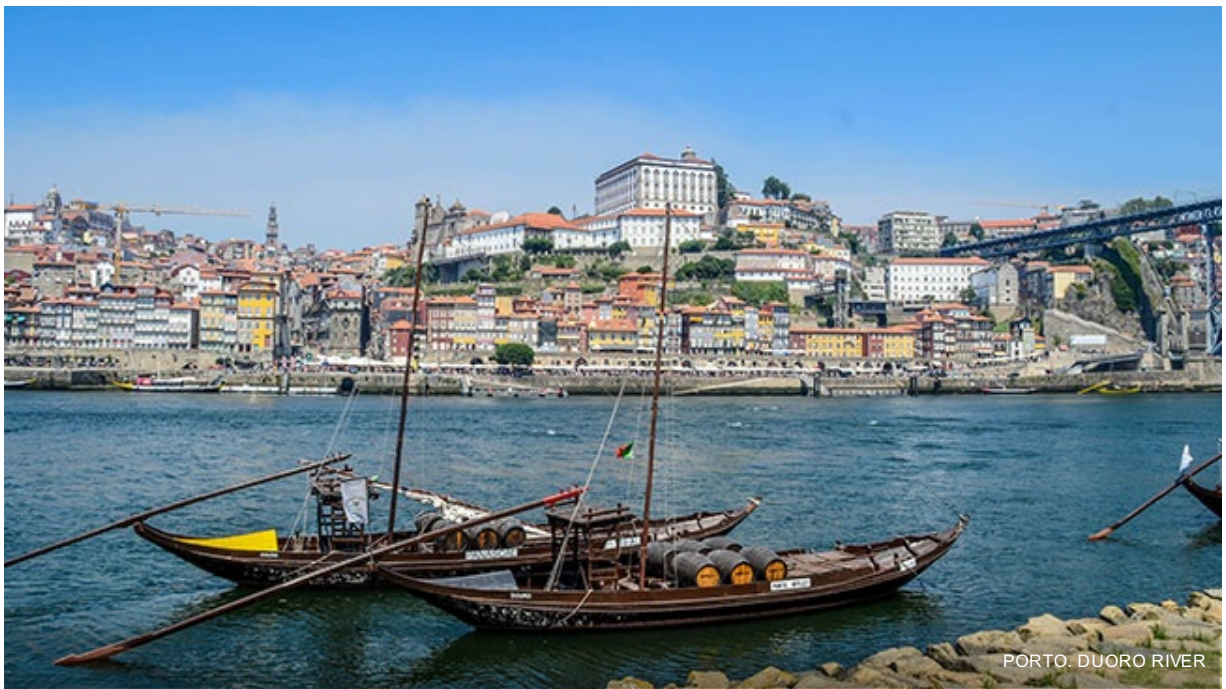
PORTO. DUORO RIVER