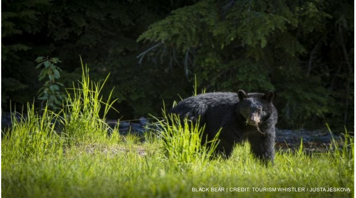
BLACK BEAR