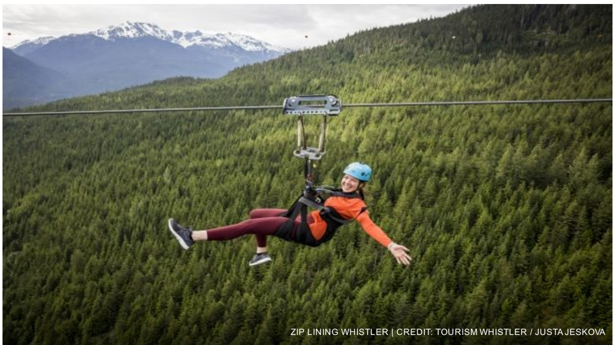
ZIP LINING WHISTLER

Exhilarating and exciting, the legendary Bear Tour environment features five ziplines; a network of 4 suspension bridges, boardwalks and forest trails showcasing stunning views of Fitzsimmons Creek. Perfect for groups, families and first-time zipliners!