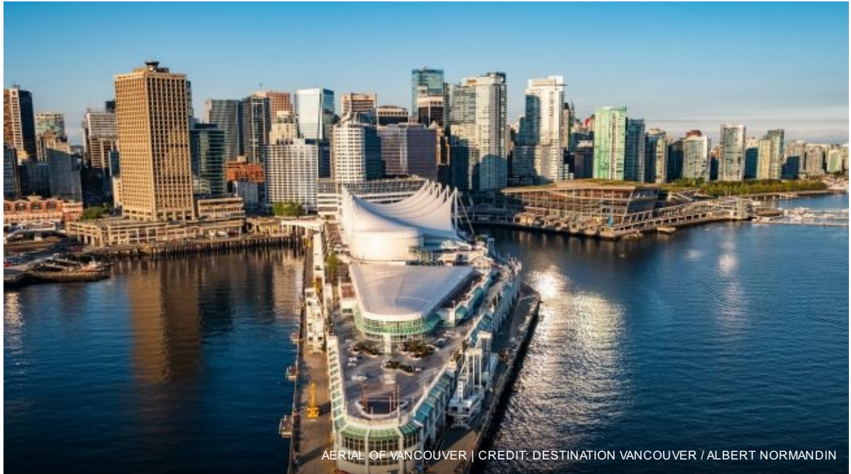
AERIAL OF VANCOUVER

Overnight in Vancouver at the Hyatt Regency Vancouver