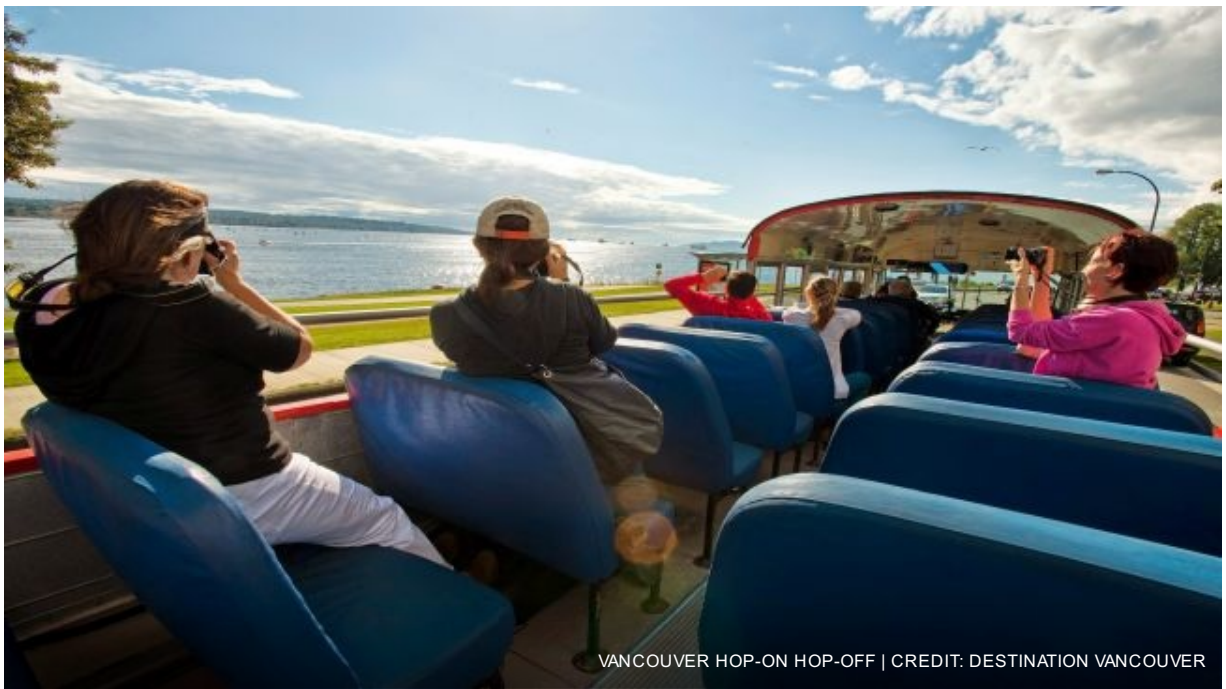
VANCOUVER HOP-ON HOP-OFF