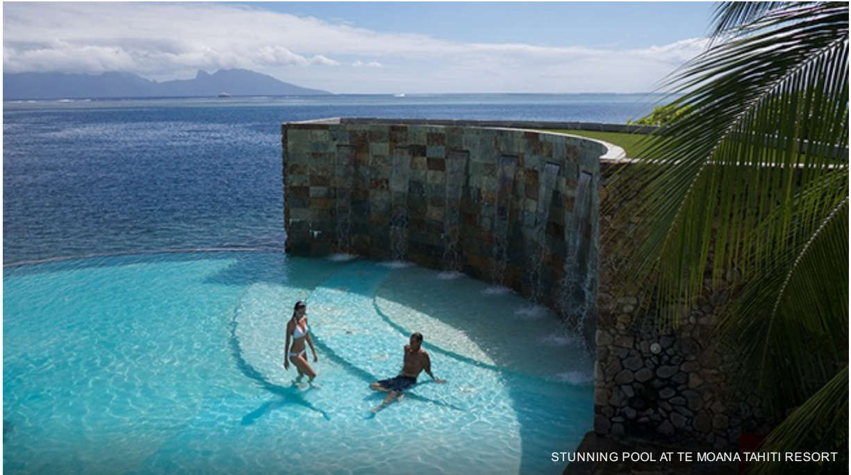
STUNNING POOL AT TE MOANA TAHITI RESORT