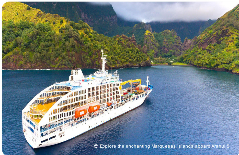
📍 Explore the enchanting Marquesas Islands aboard Aranui 5