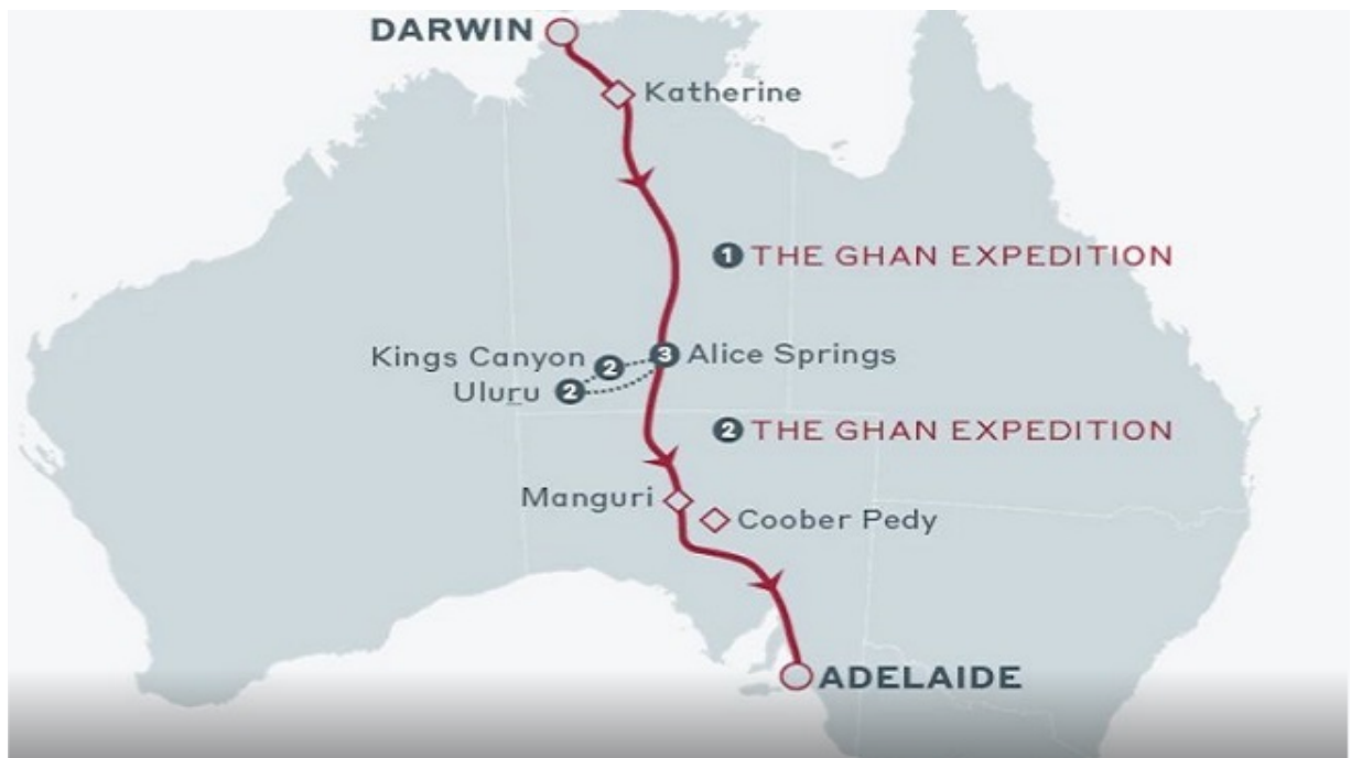
The Ghan - Red Centre Spectacular