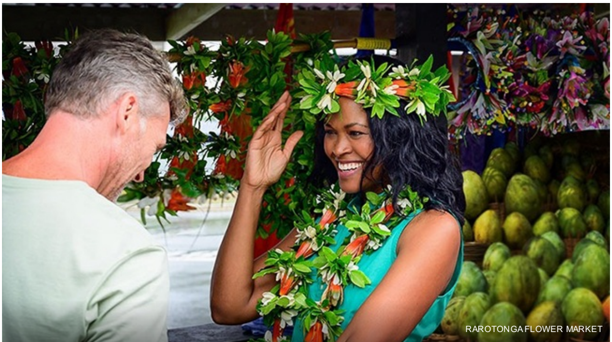
RAROTONGA FLOWER MARKET