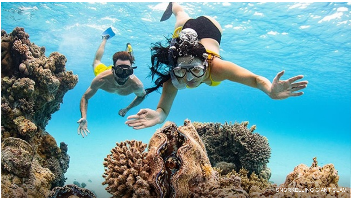
SNORKELLING GIANT CLAM