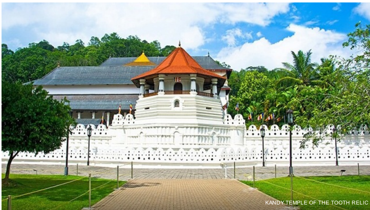
KANDY TEMPLE OF THE TOOTH RELIC