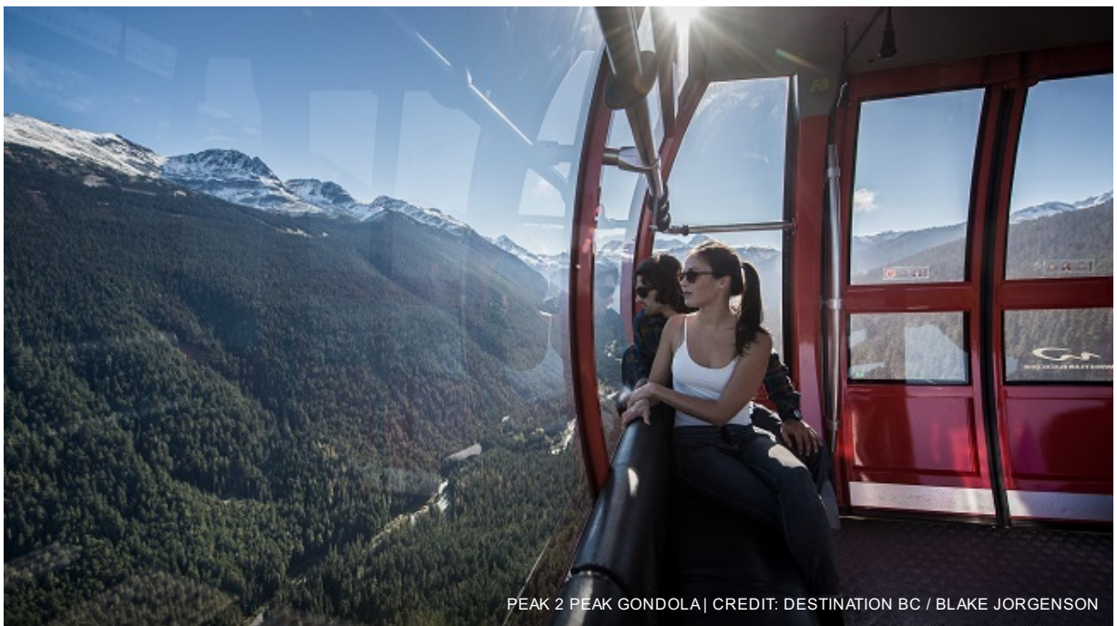
PEAK 2 PEAK GONDOLA

Overnight in Whistler at Delta Whistler Village Suites