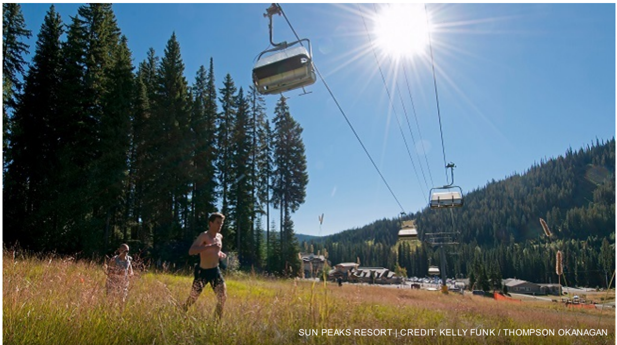
SUN PEAKS RESORT

Overnight in Sun Peaks at Sun Peaks Grand Hotel