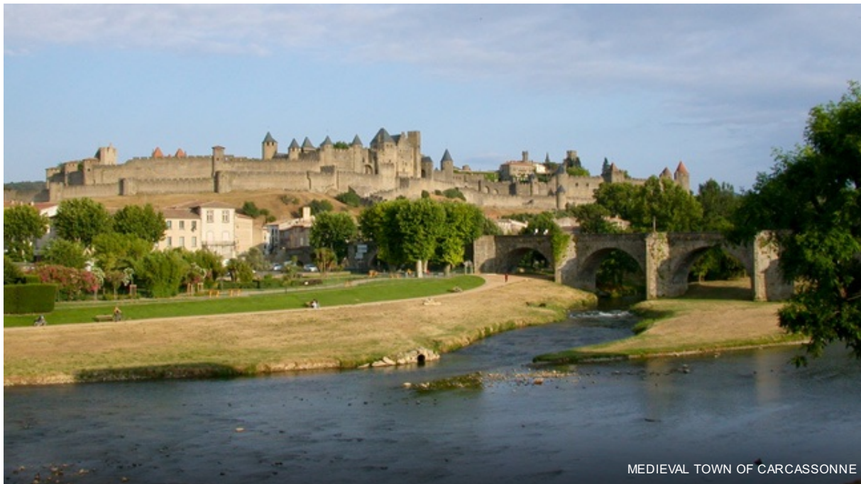
MEDIEVAL TOWN OF CARCASSONNE