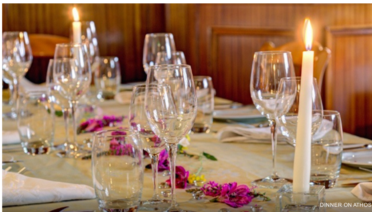
DINNER ON ATHOS