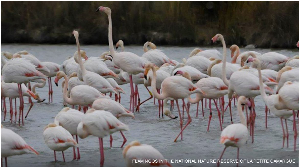
FLAMINGOS IN THE NATIONAL NATURE RESERVE OF LA PETITE CAMARGUE

After breakfast, transfer by a private chauffeured minibus to your choice of location in Beziers*.