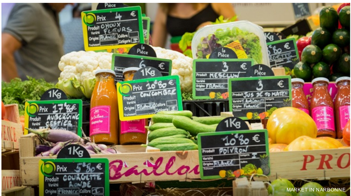
MARKET IN NARBONNE