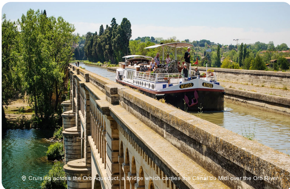
📍 Cruising across the Orb Aqueduct, a bridge which carries the Canal du Midi over the Orb River