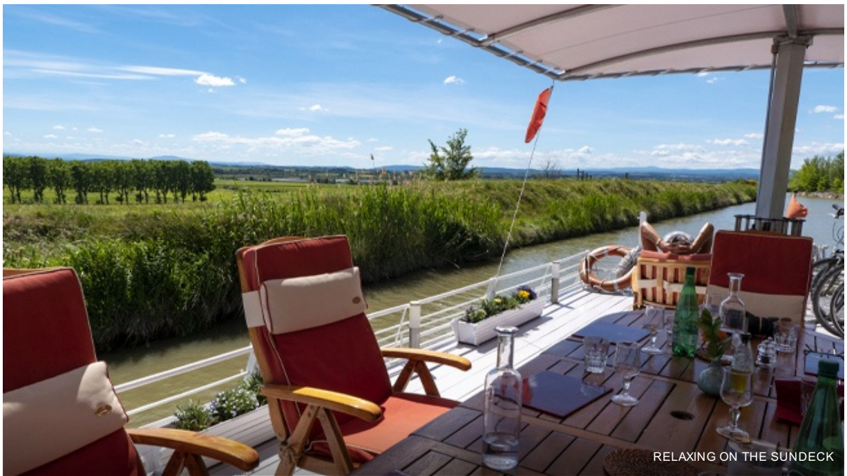
RELAXING ON THE SUNDECK

This morning cruise through the Petite Camargue , passing pink flamingos, bee-eaters and Europe's largest mussel and oyster beds, as well as the unique 'round lock' at Agde. After lunch in Marseillan you will end a perfect day with a fascinating tour of the Noilly Prat distillery and, if you choose, a tasting before the Captain's Farewell Dinner on board.