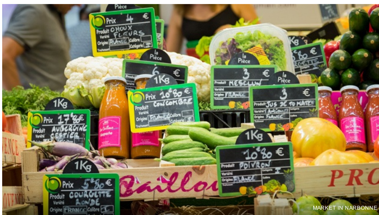
MARKET IN NARBONNE