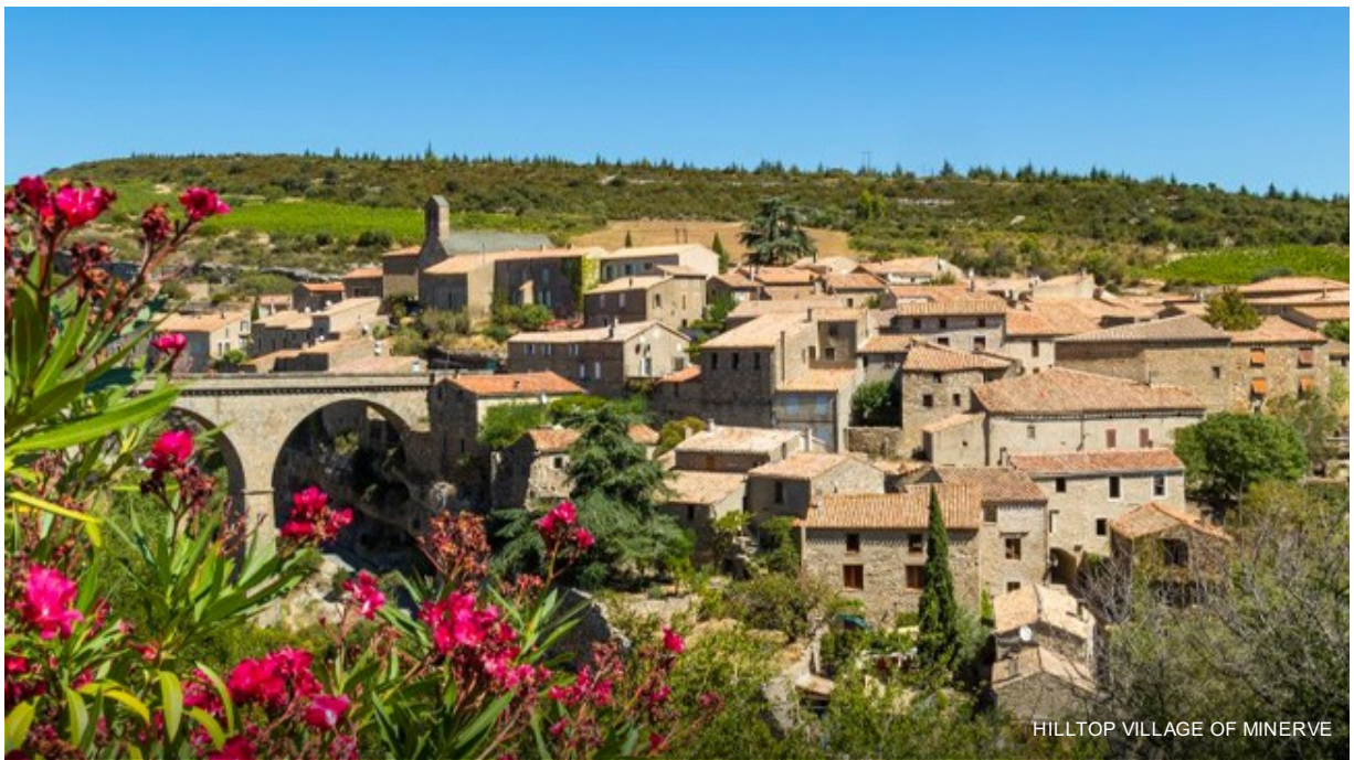
HILLTOP VILLAGE OF MINERVE