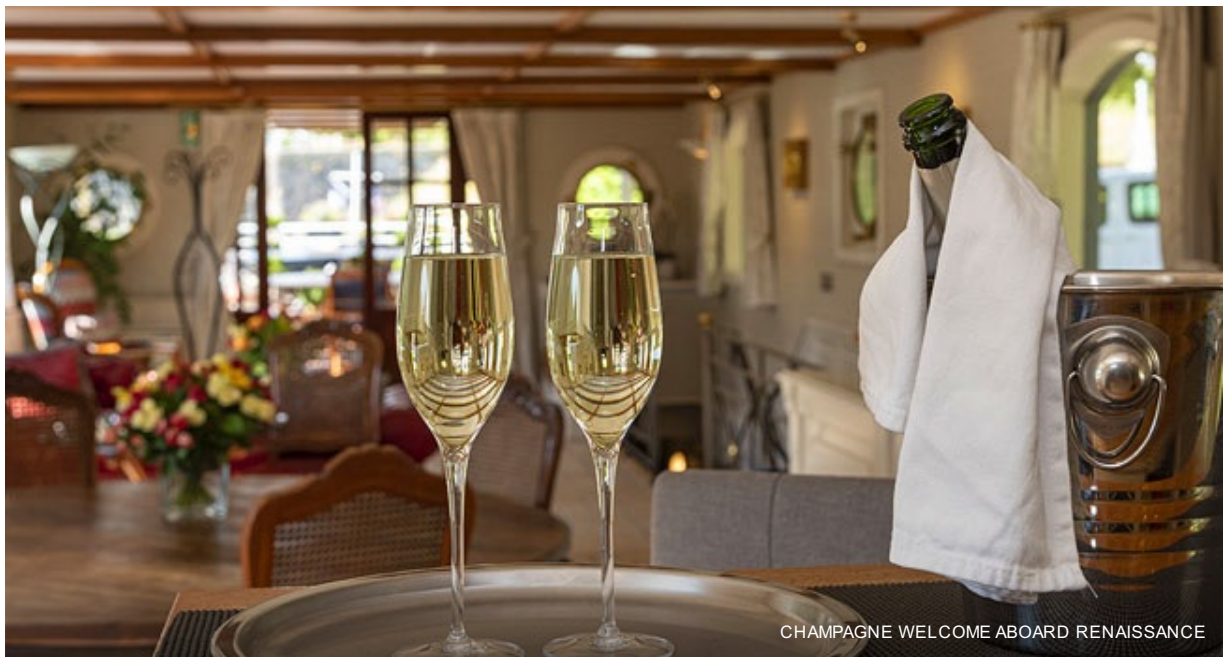
CHAMPAGNE WELCOME ABOARD RENAISSANCE