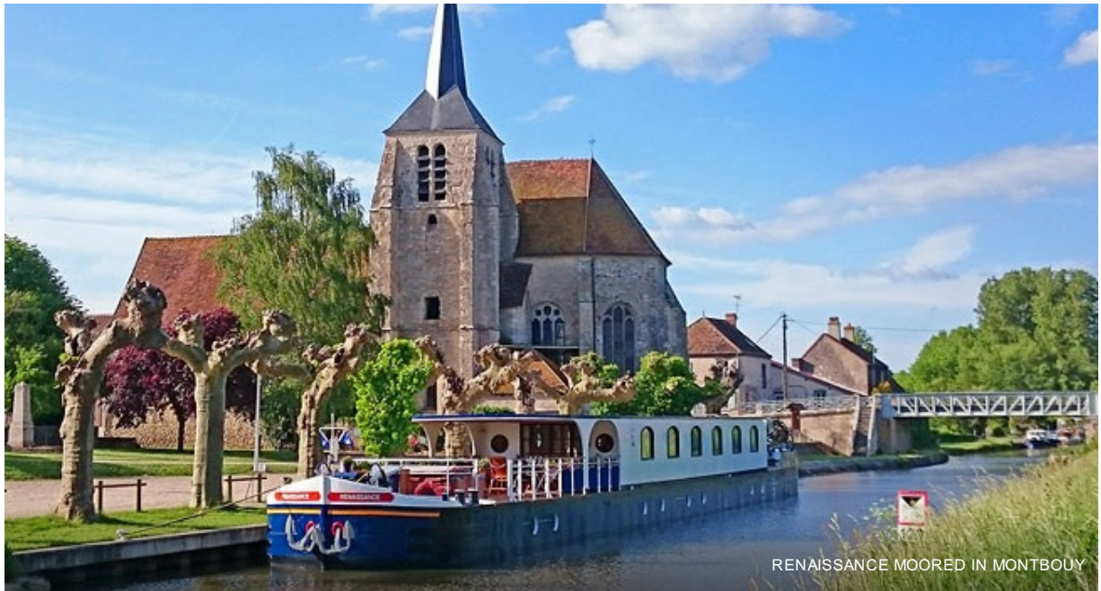
RENAISSANCE MOORED IN MONTBOUY