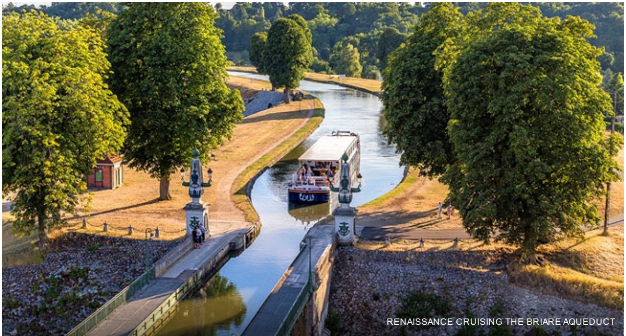
RENAISSANCE CRUISING THE BRIARE AQUEDUCT