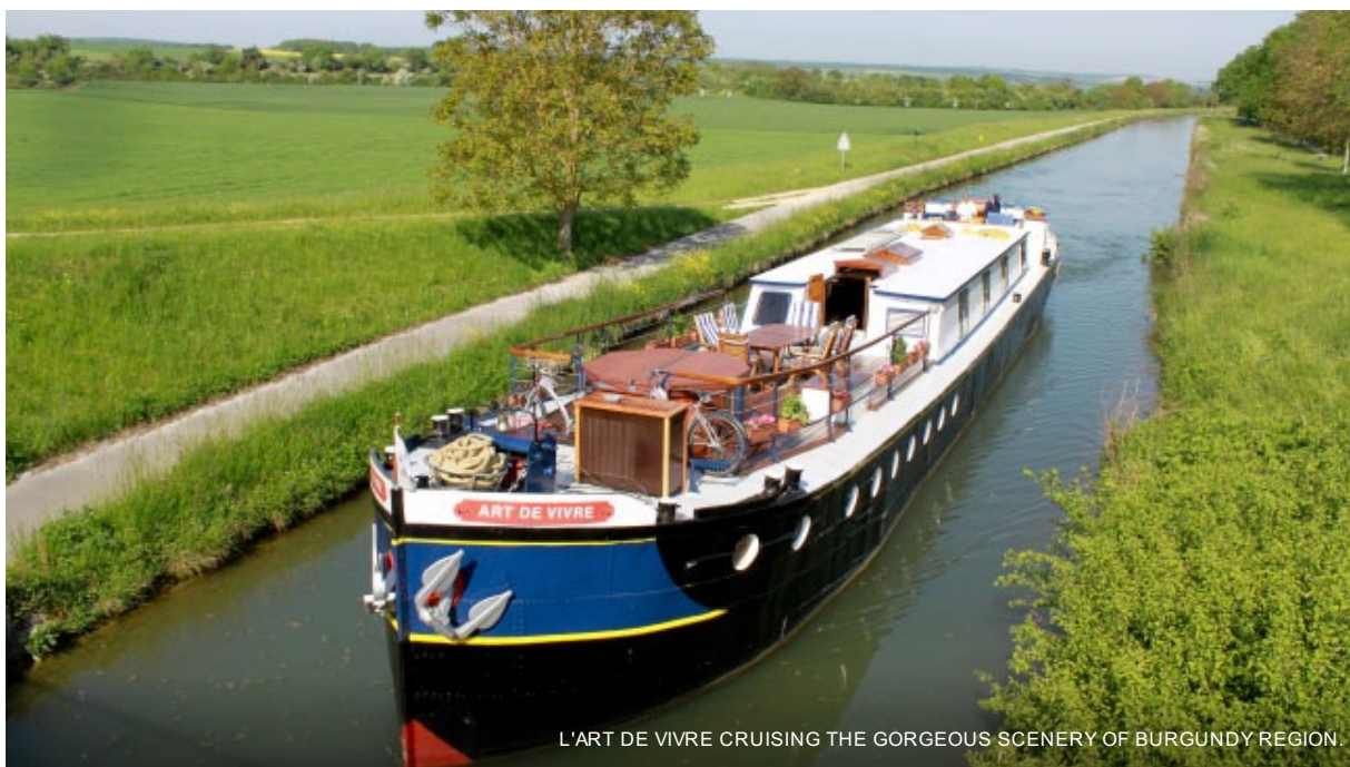
L'ART DE VIVRE CRUISING THE GORGEOUS SCENERY OF BURGUNDY REGION.