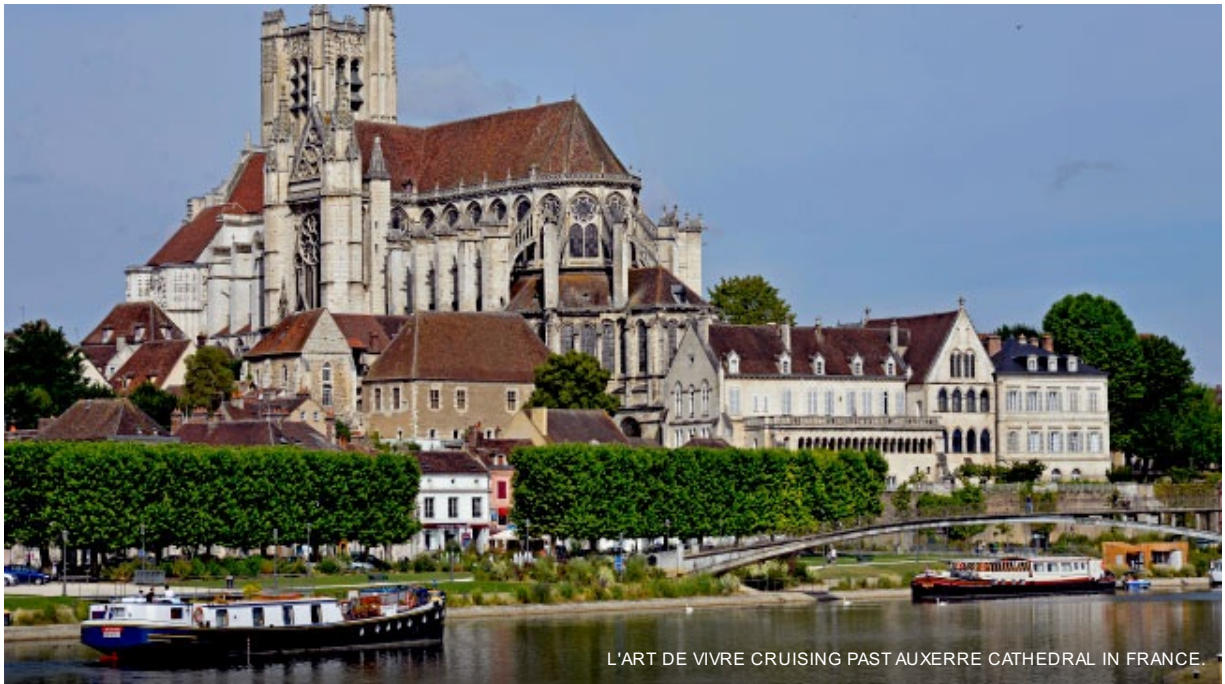
L'ART DE VIVRE CRUISING PAST AUXERRE CATHEDRAL IN FRANCE.