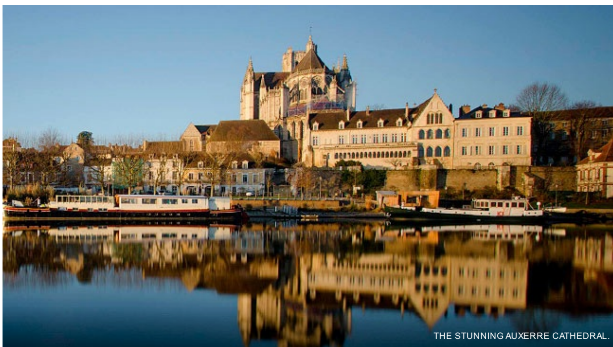
THE STUNNING AUXERRE CATHEDRAL.