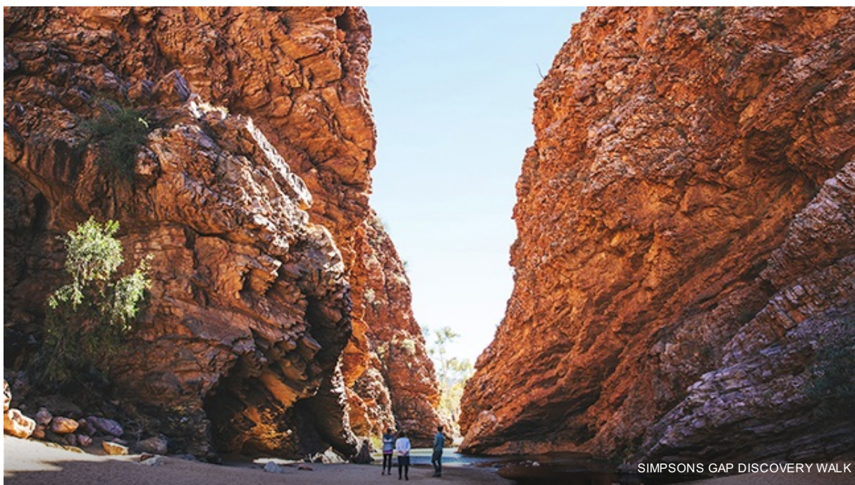
SIMPSON'S GAP DISCOVERY WALK