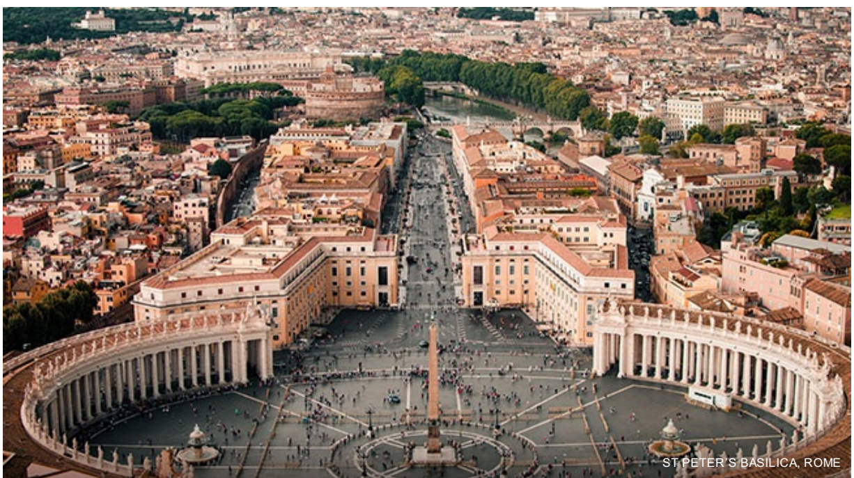
ST PETER'S BASILICA, ROME