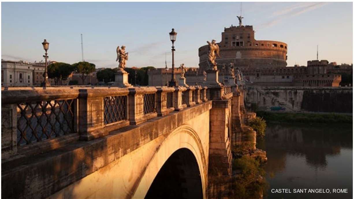
CASTEL SANT ANGELO, ROME