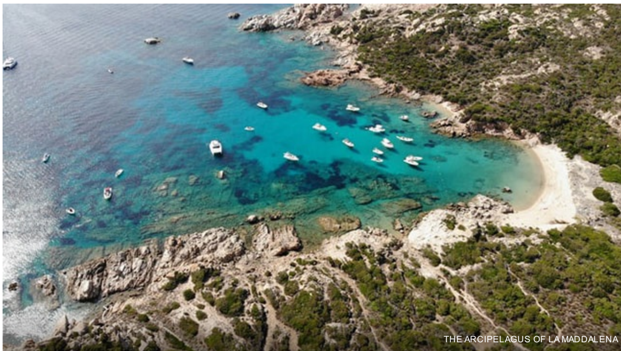
THE ARCIPELAGUS OF LA MADDALENA