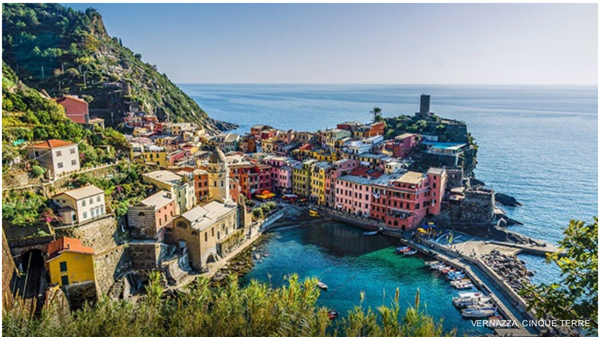
VERNAZZA, CINQUE TERRE