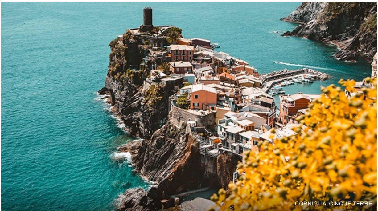
CORNIGLIA, CINQUE TERRE