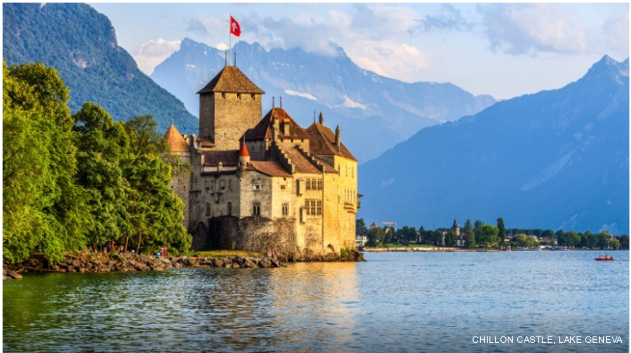
CHILLON CASTLE, LAKE GENEVA

We recommend visiting Chillon Castle in the morning, taking the lake steamer to Vevey and continuing by train to Chexbres in the late afternoon for the wine tasting.