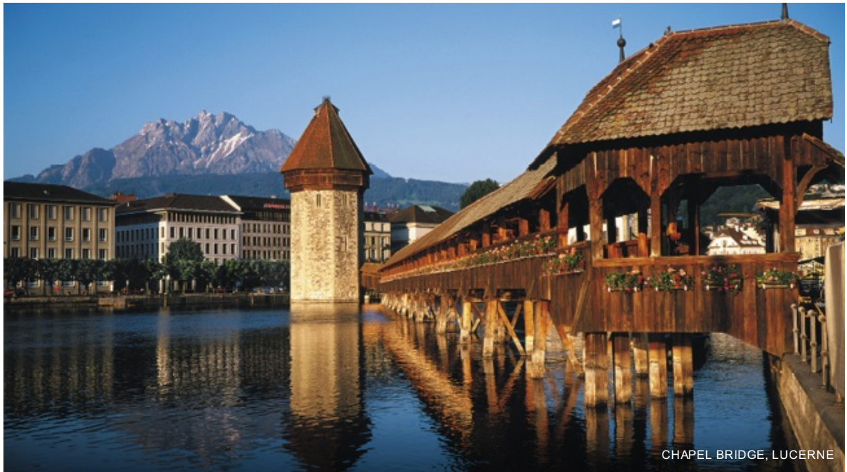
CHAPEL BRIDGE, LUCERNE

Overnight stay in Lucerne in a 3-Star Hotel .