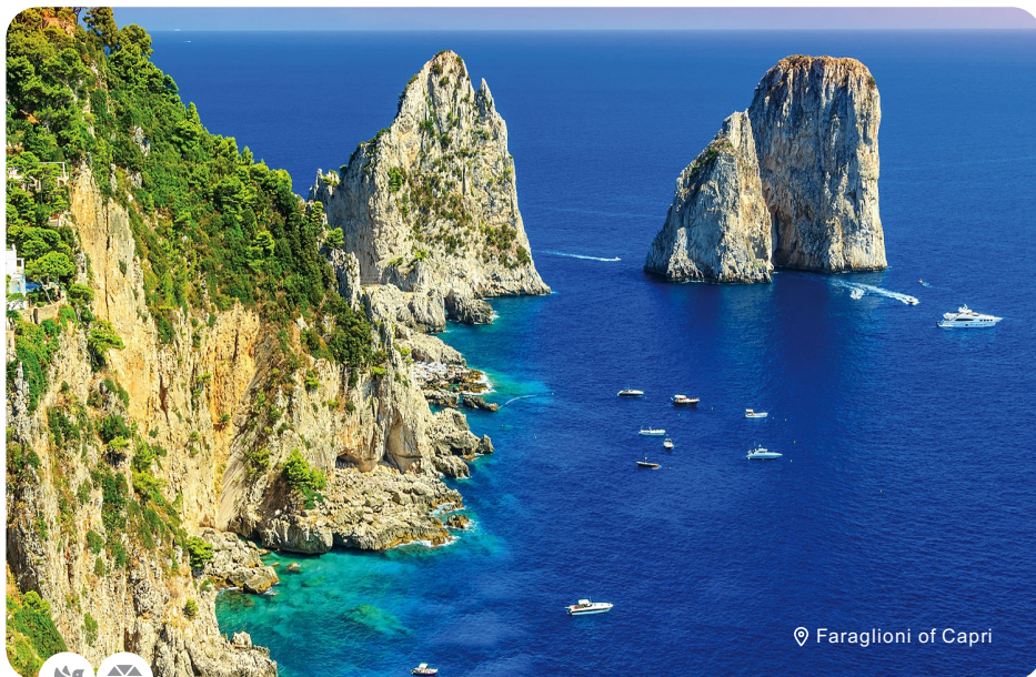
Faraglioni of Capri