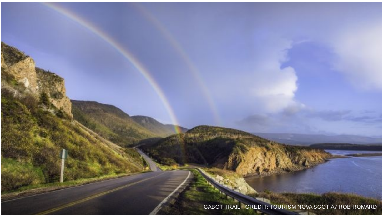
CABOT TRAIL

Overnight stay in Baddeck at Inverary Resort