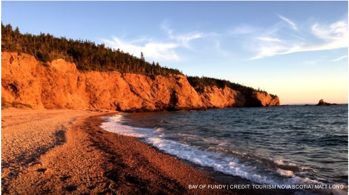
BAY OF FUNDY