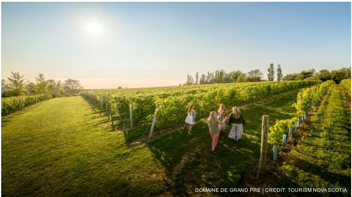
DOMAINE DE GRAND PRÉ | CREDIT: TOURISM NOVA SCOTIA