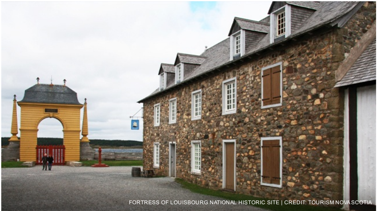
FORTRESS OF LOUISBOURG NATIONAL HISTORIC SITE