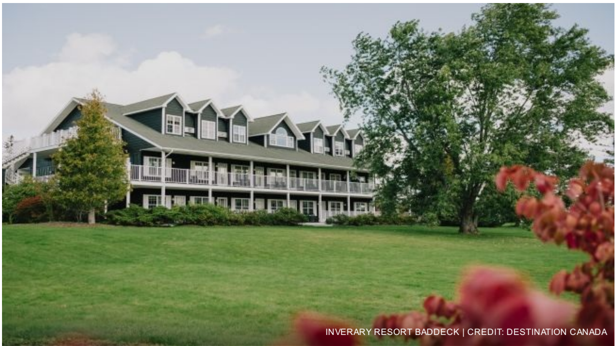
INVERARY RESORT BADDECK