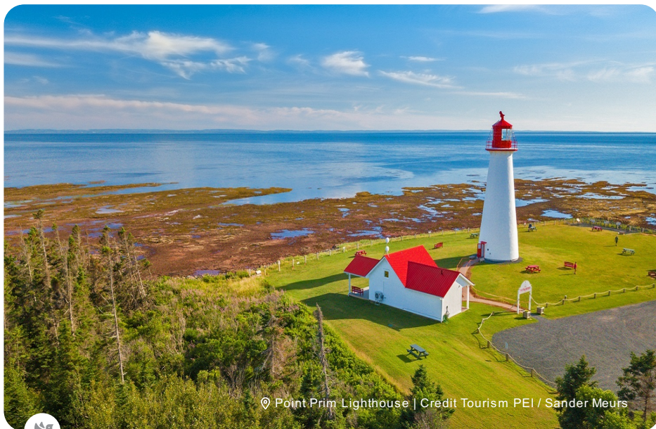
Point Prim Lighthouse