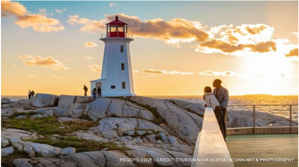
PEGGY'S COVE

Overnight in Lunenburg at the Blue Nose Lodge