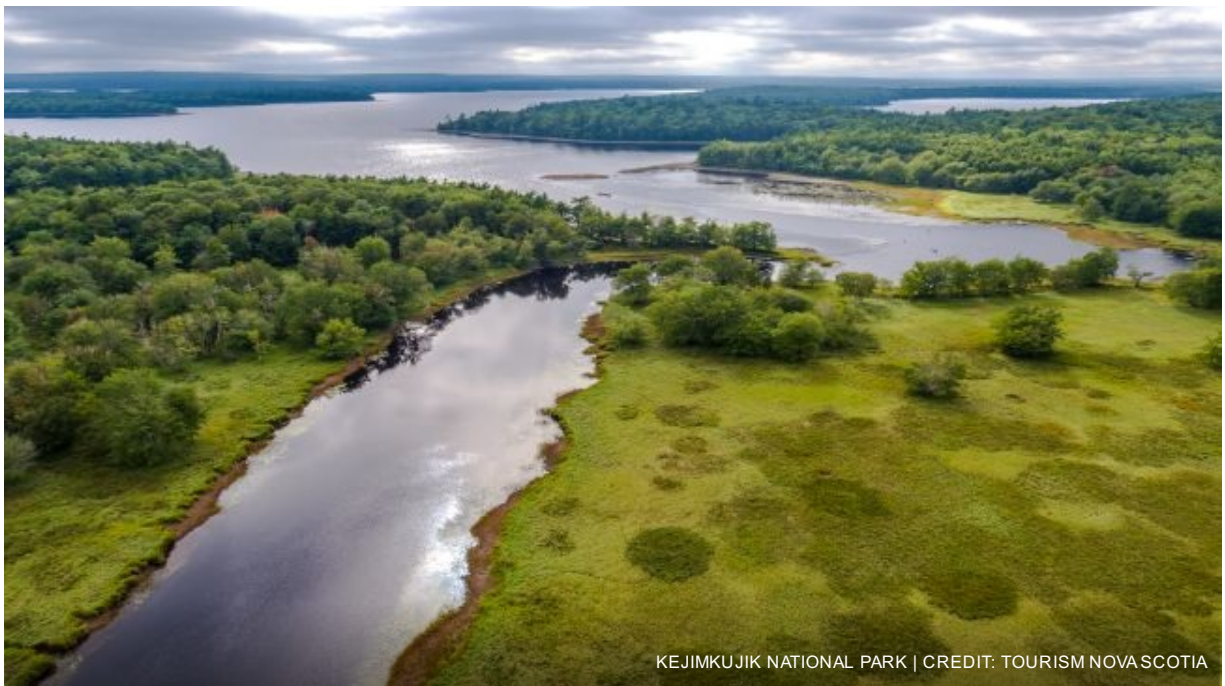
KEJIMIKUJIK NATIONAL PARK