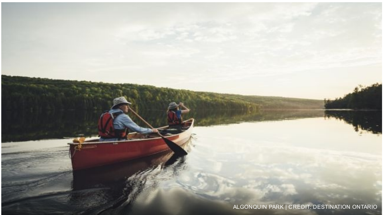
ALGONQUIN PARK

Overnight stay in Huntsville at Deerhurst Resort