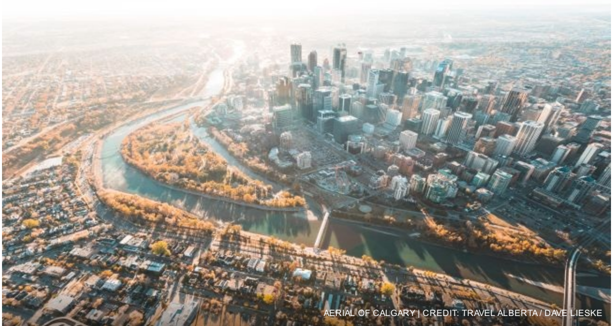
AERIAL OF CALGARY

Today you will leave behind the fresh mountain air and colourful sights of the Rockies. We will schedule a transfer to bring you to downtown Calgary, or to the Calgary Airport to connect with your flight home.