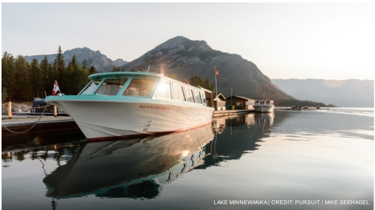
LAKE MINNEWANKA

Saddle up for a ride along the Bow River in Banff and a Western style cookout. Choose from riding on horseback or in a covered wagon through the beautiful Rocky Mountain terrain.