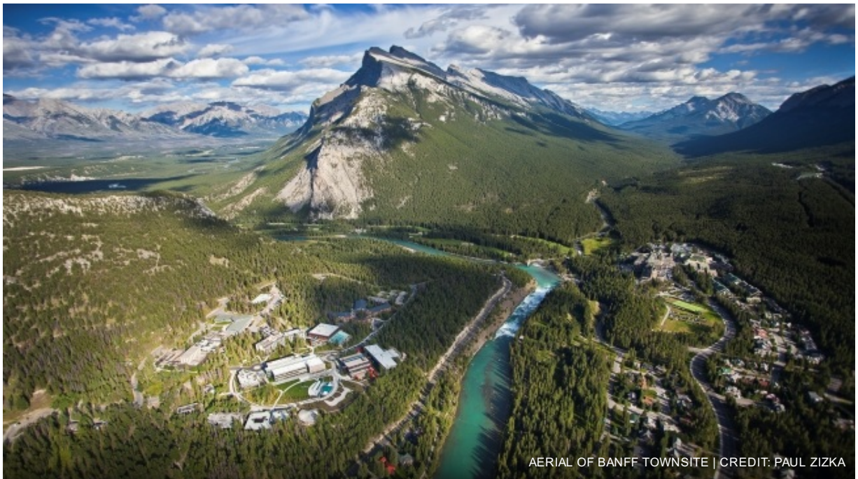
AERIAL OF BANFF TOWNSITE

Overnight stay in Banff at the Banff Caribou Lodge