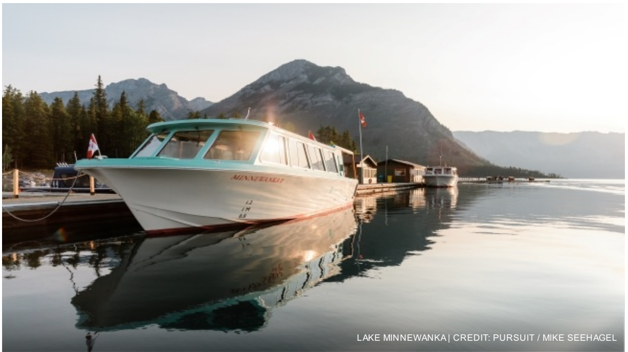
LAKE MINNEWANKA