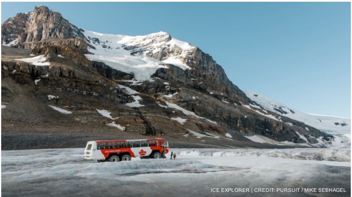
ICE EXPLORER