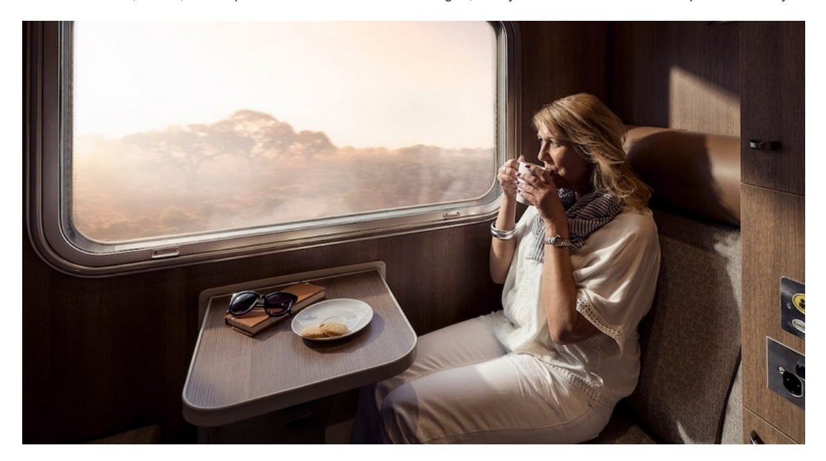
Prices are dynamic based on travel dates. Please proceed to Book Now or Contact Us for details.

Australia's iconic rail journeys offer purpose-built carriages to do it in superb style. Our Gold Service Single is a comfortable sleeper cabin option that offers all the luxurious inclusions of the Gold Service Twin such as fully inclusive dining with three gourmet meals per day, all-inclusive Australian wines, beers, base spirits and non-alcoholic beverages, and your choice of Off Train Experiences as you travel.