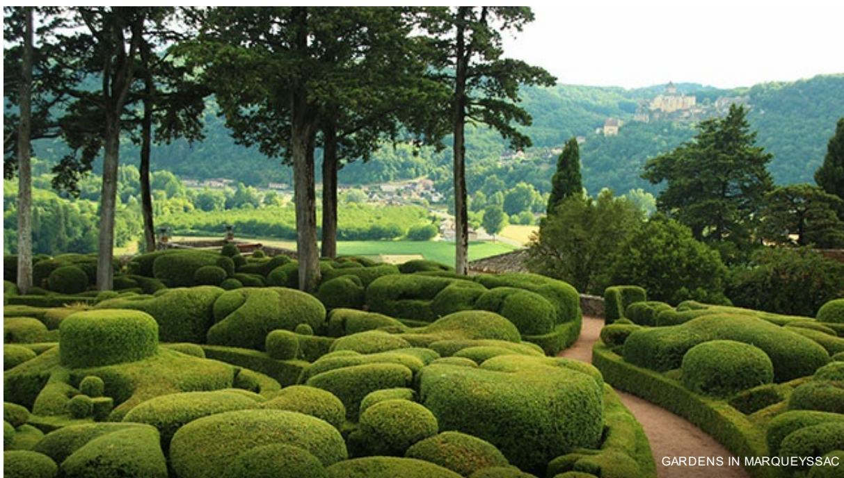
GARDENS IN MARQUEYSSAC