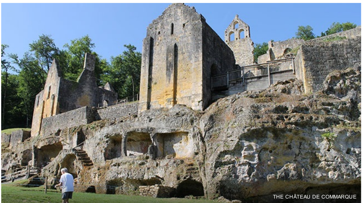
THE CHÂTEAU DE COMMARQUE