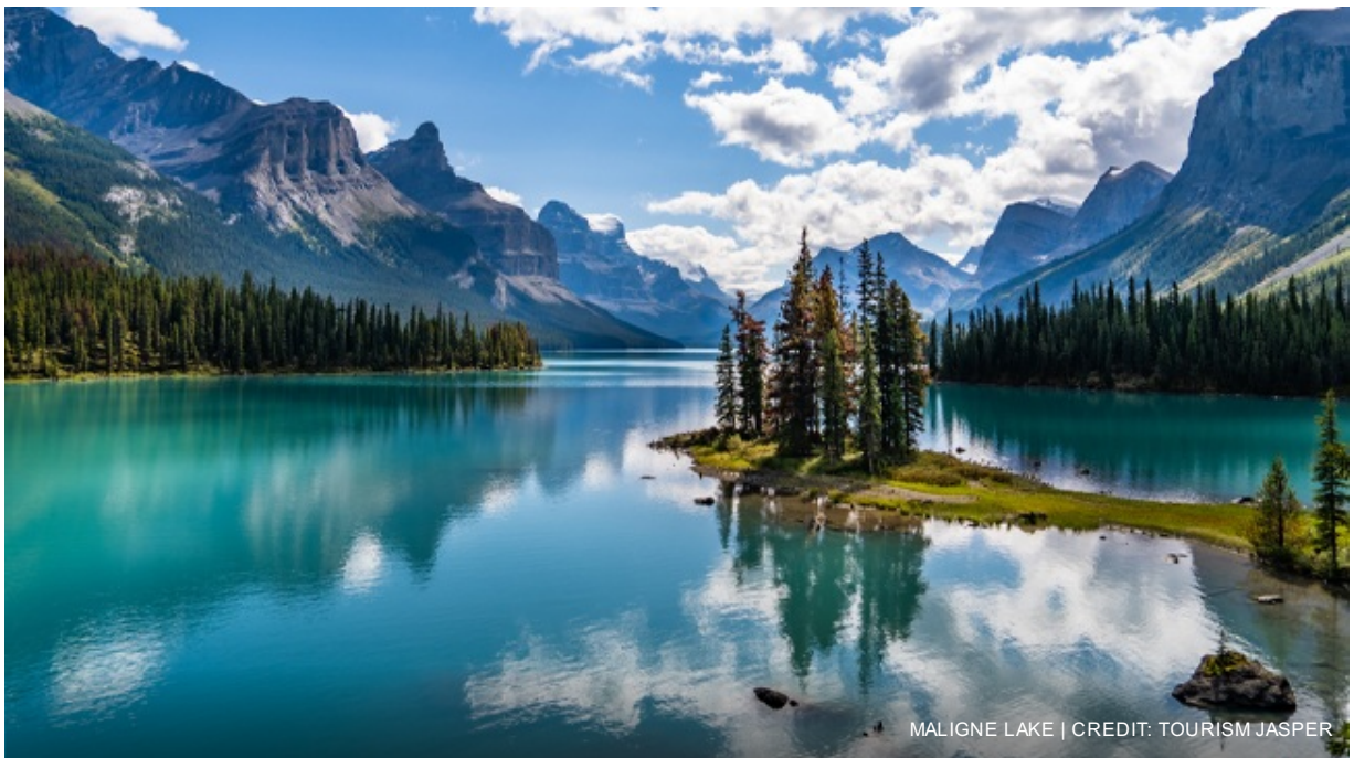
MALIGNE LAKE