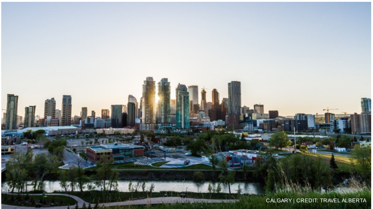
CALGARY | CREDIT: TRAVEL ALBERTA