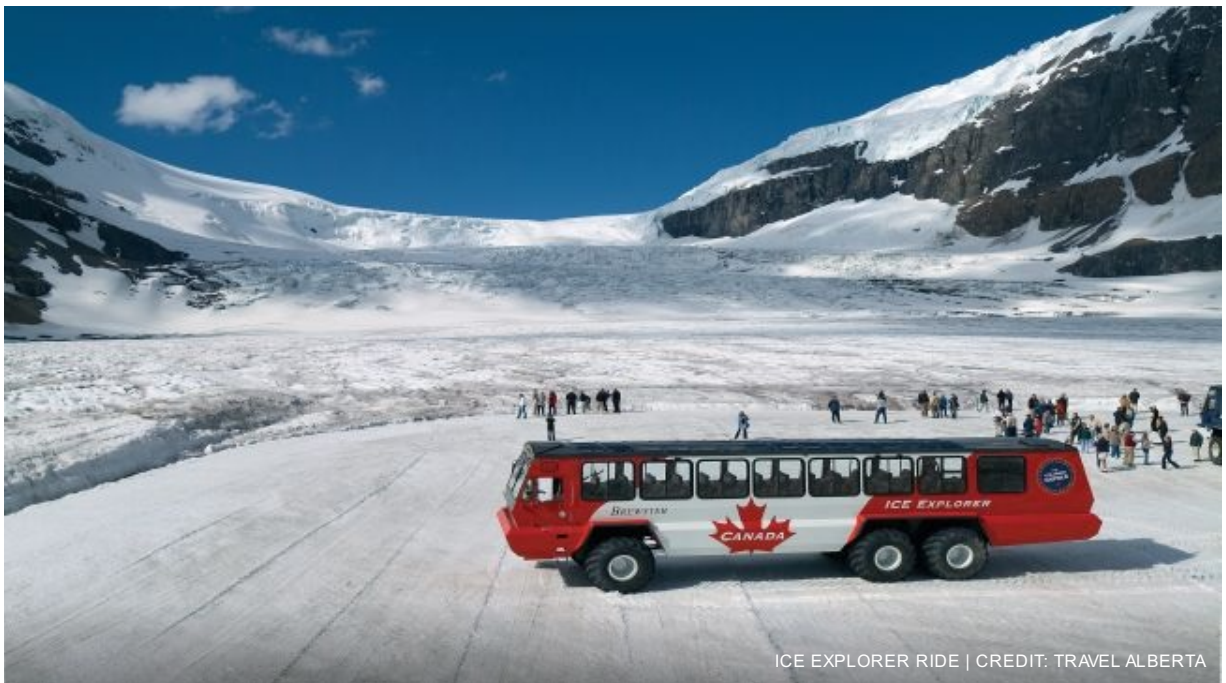
ICE EXPLORER RIDE

Overnight in Banff at Fairmont Banff Springs Hotel