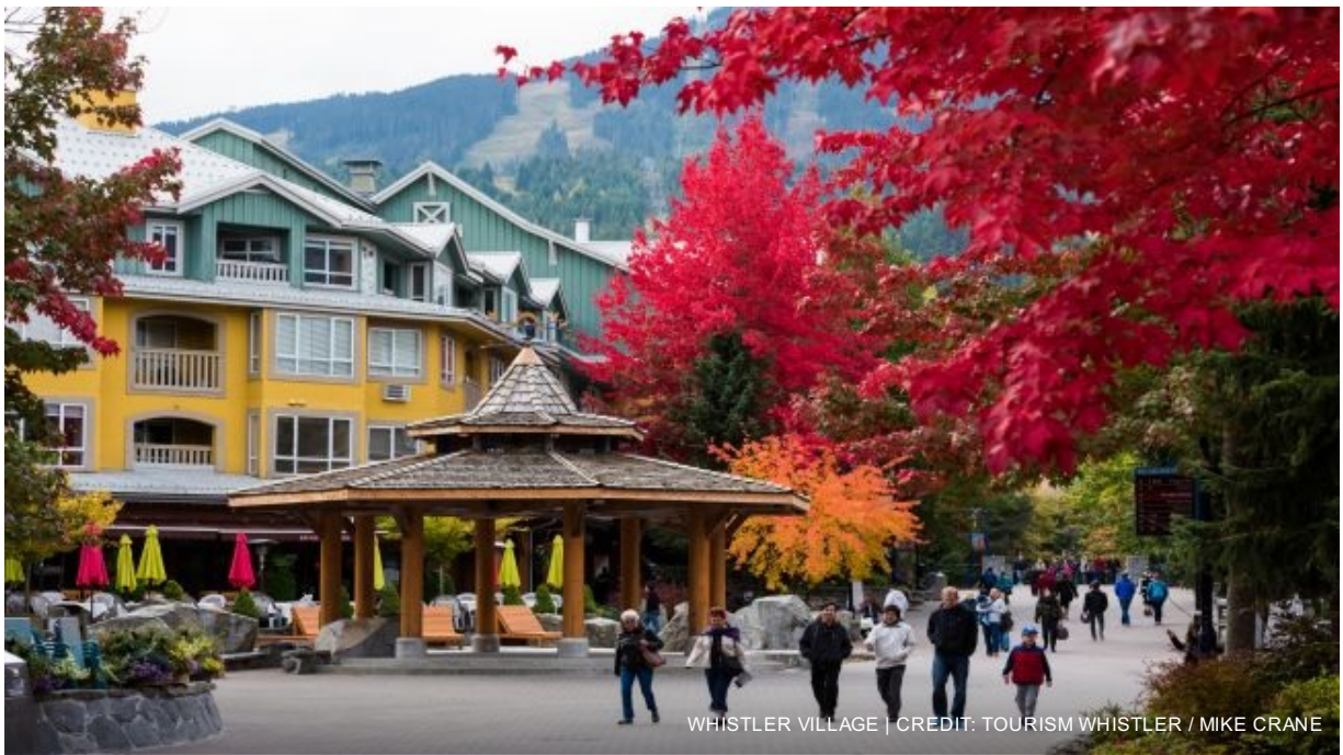
WHISTLER VILLAGE