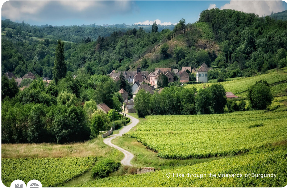
📍 Hike through the vineyards of Burgundy