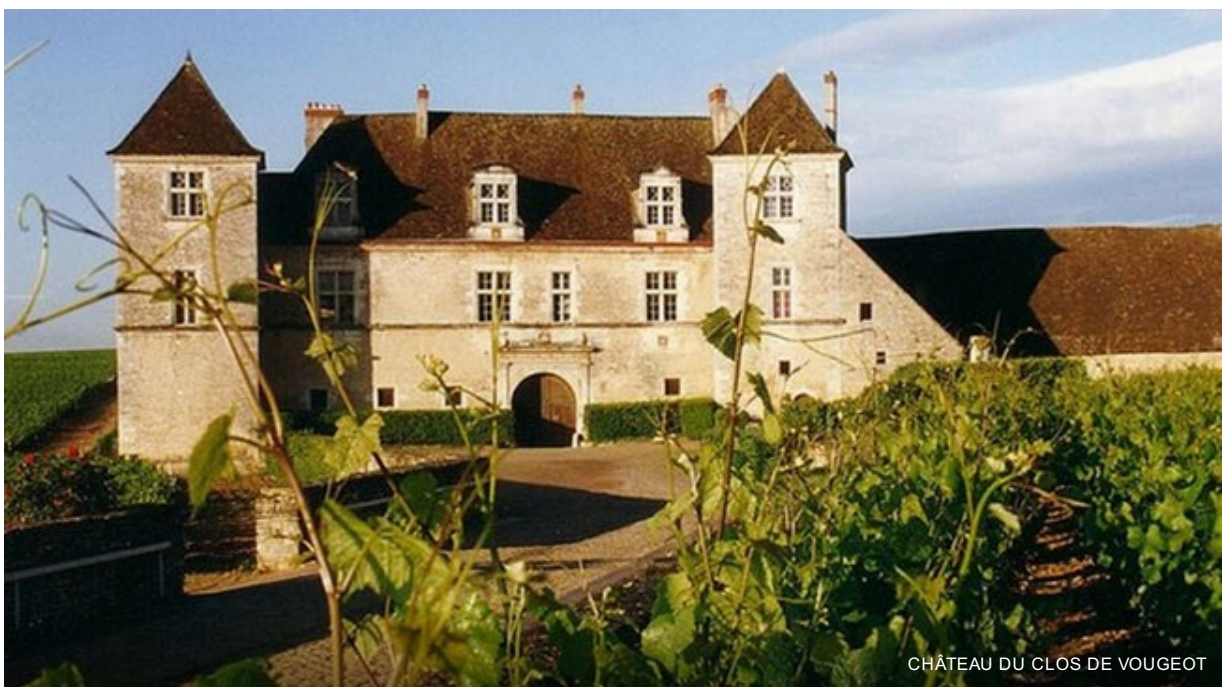
CHÂTEAU DU CLOS DE VOUGEOT