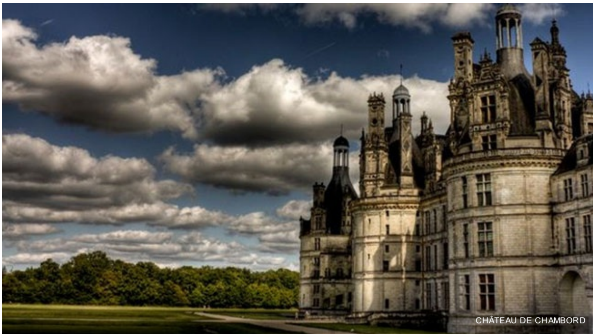
CHÂTEAU DE CHAMBORD