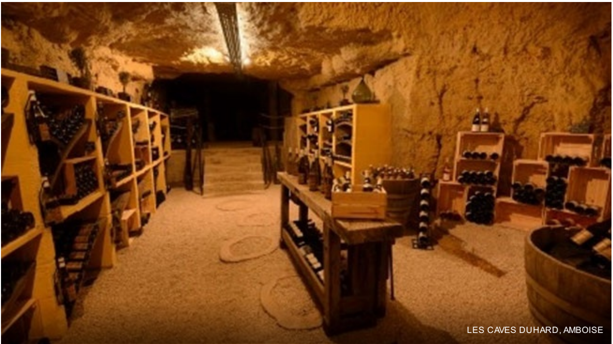
LES CAVES DUHARD, AMBOISE