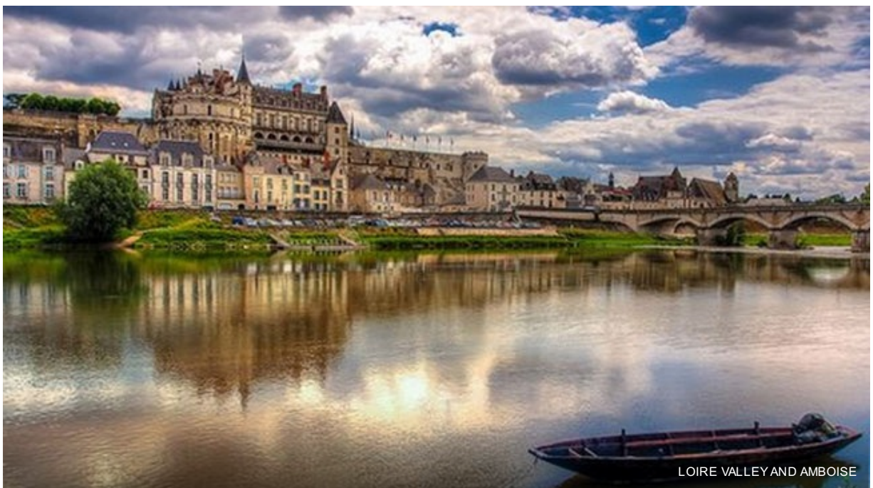
LOIRE VALLEY AND AMBOISE