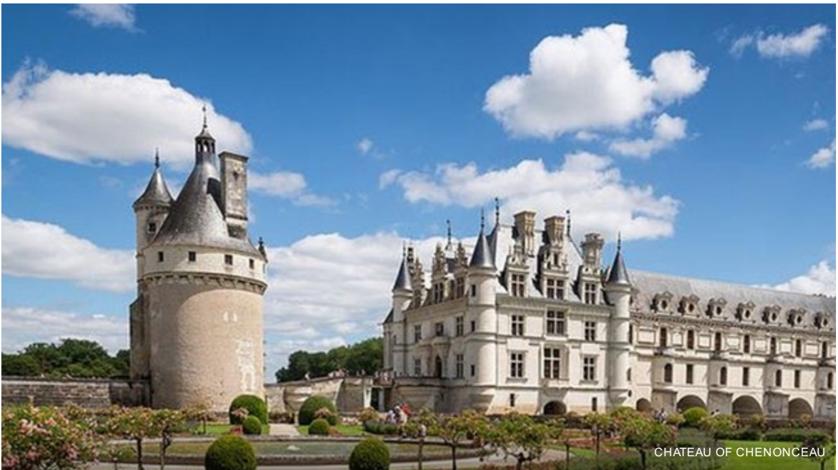
CHATEAU OF CHENONCEAU