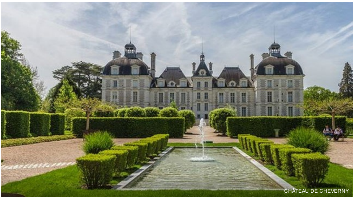
CHÂTEAU DE CHEVERNY