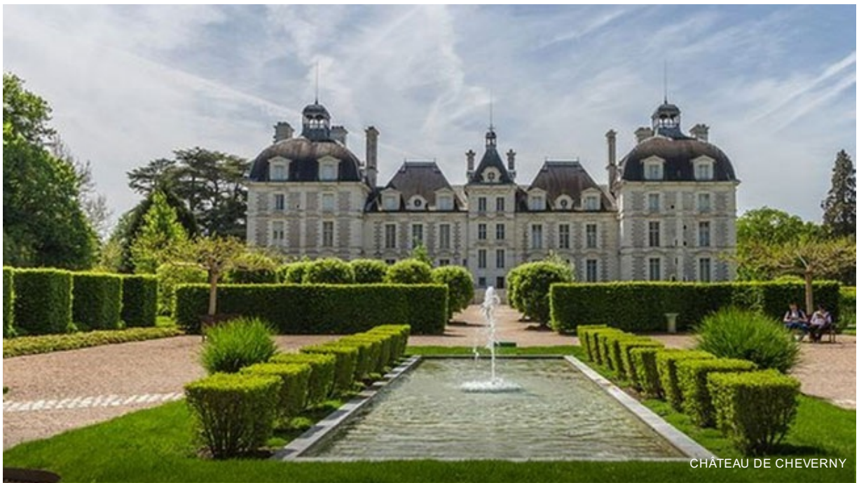
CHÂTEAU DE CHEVERNY