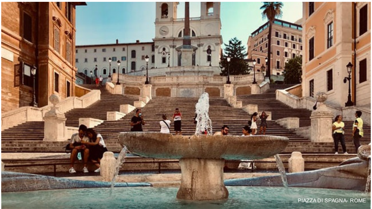
PIAZZA DI SPAGNA- ROME