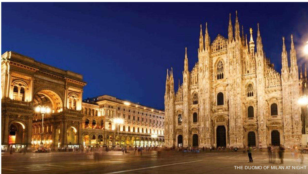
THE DUOMO OF MILAN AT NIGHT

Overnight in Milan at the Starhotels Ritz or similar.