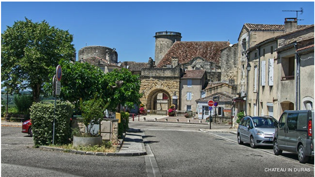
CHATEAU IN DURAS