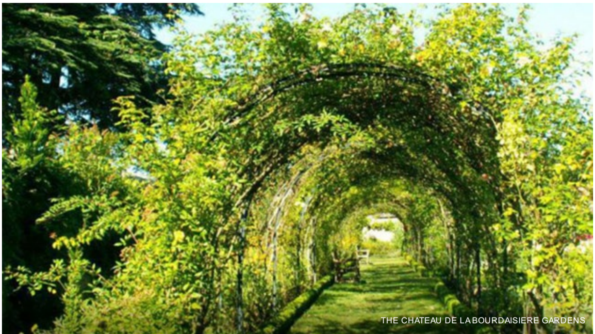
THE CHATEAU DE LABOURDAISIERE GARDENS