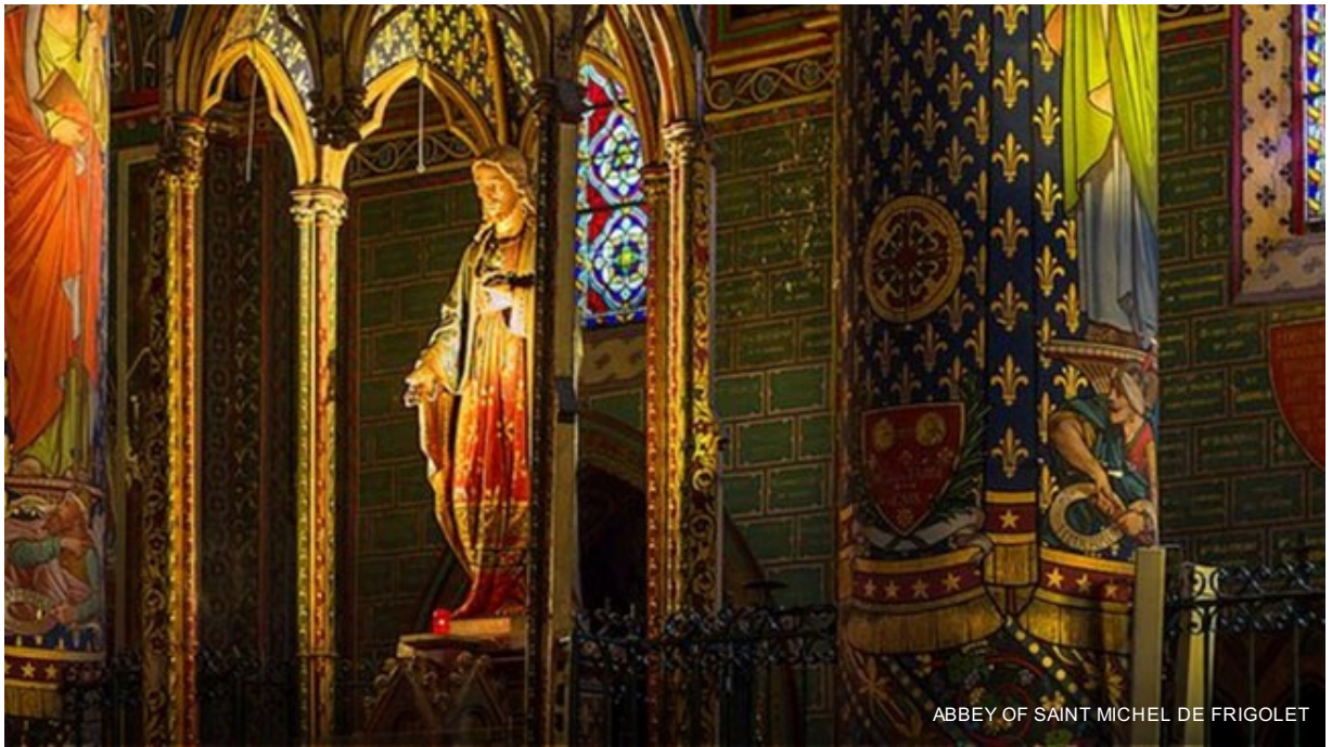
ABBEY OF SAINT MICHEL DE FRIGOLET