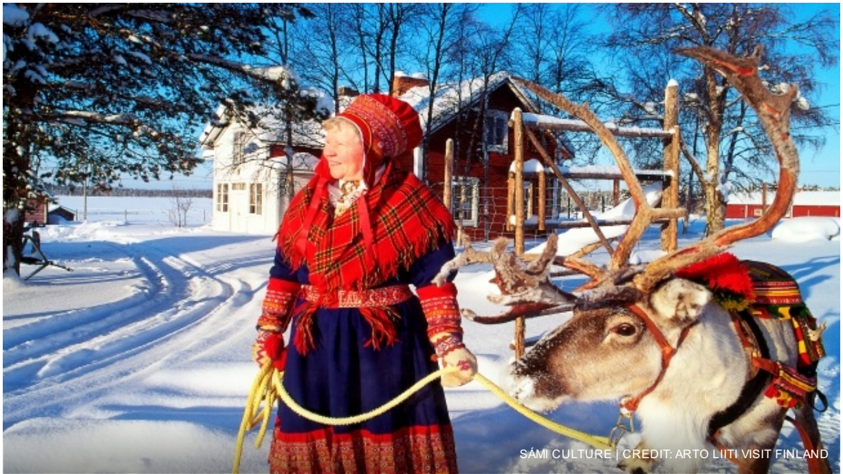
SÁMI CULTURE