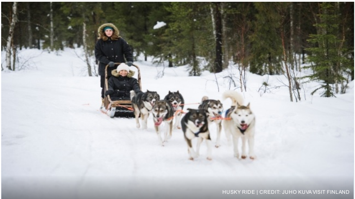
HUSKY RIDE