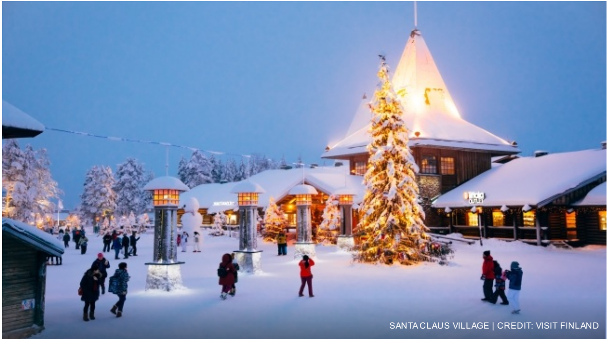
SANTACLAVIS VILLAGE