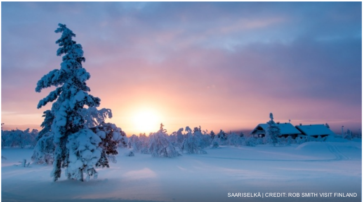
SAARISELKÄ