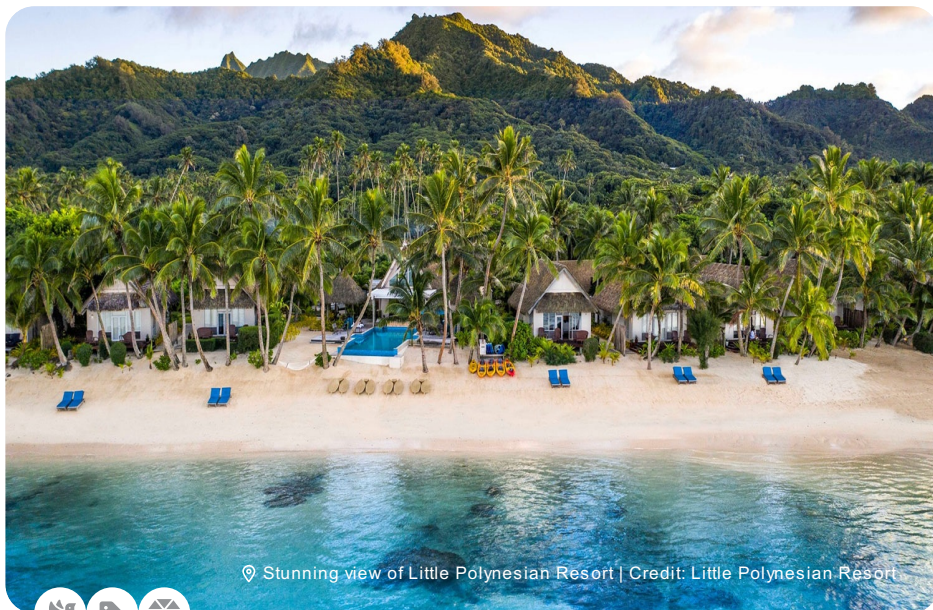
Stunning view of Little Polynesian Resort