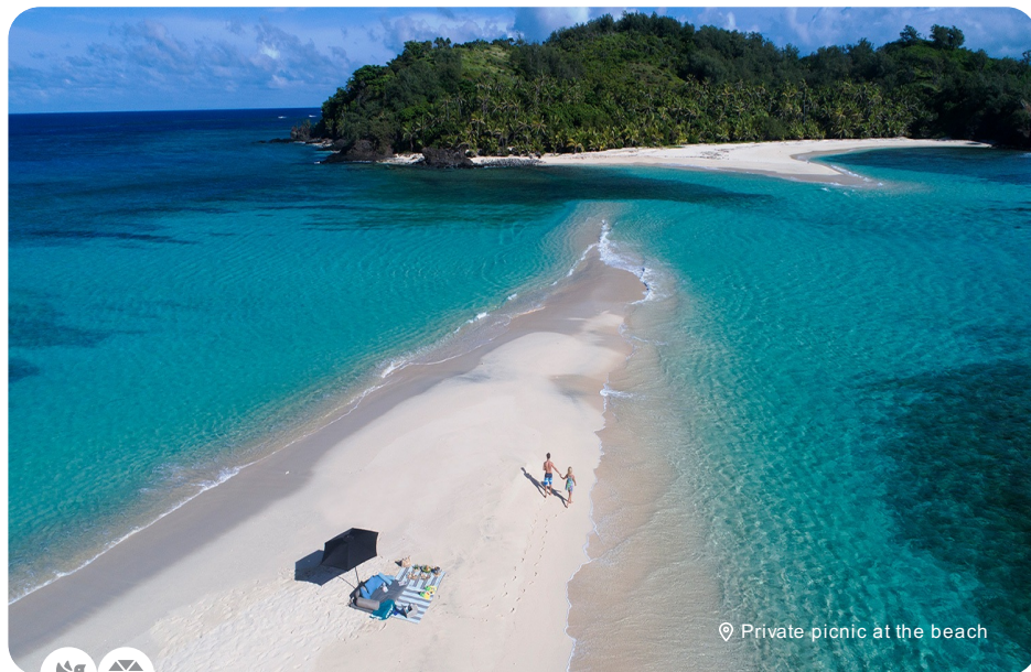
Private picnic at the beach