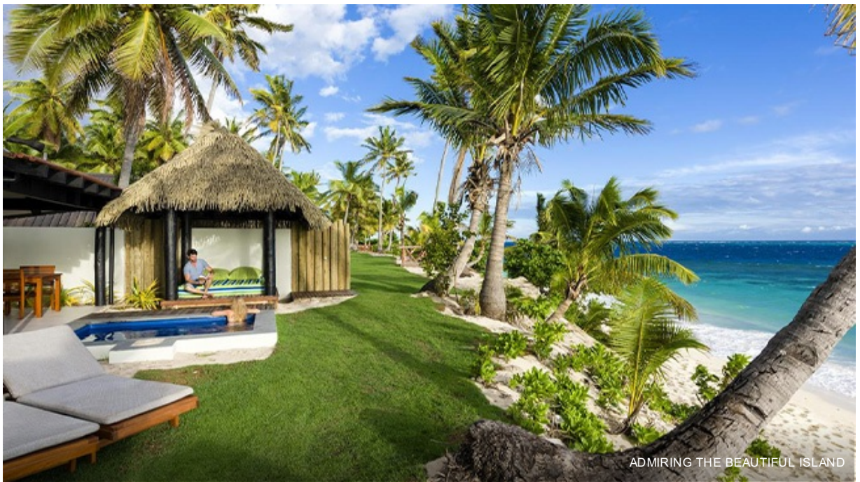
ADMIRING THE BEAUTIFUL ISLAND