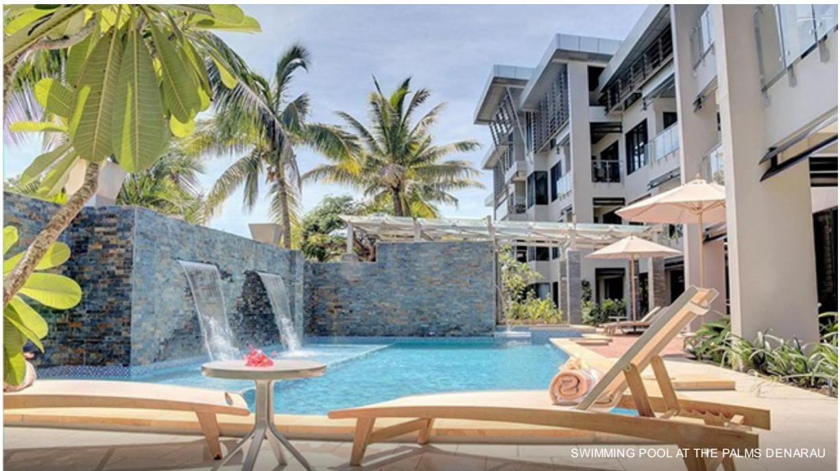
SWIMMING POOL AT THE PALMS DENARAU