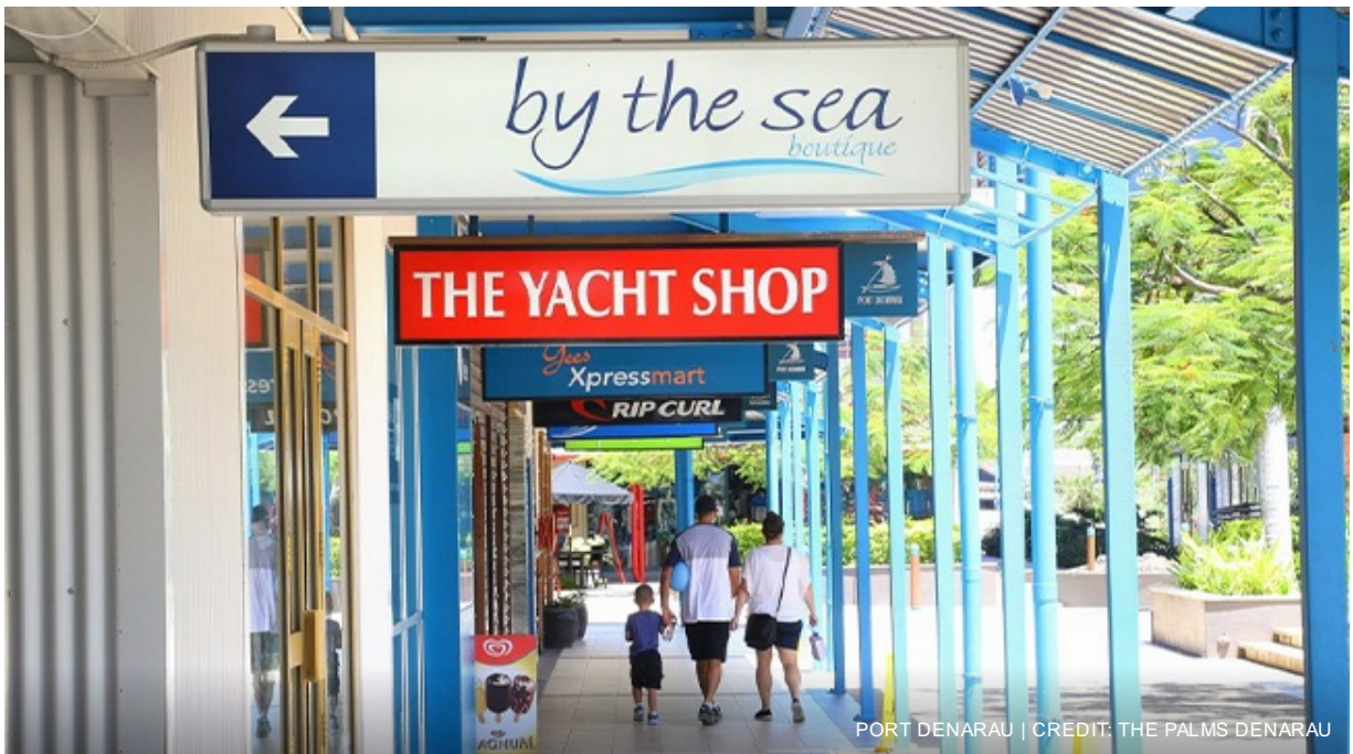
PORT DENARAU

Overnight stay at The Palms Denarau in a Guest Room.