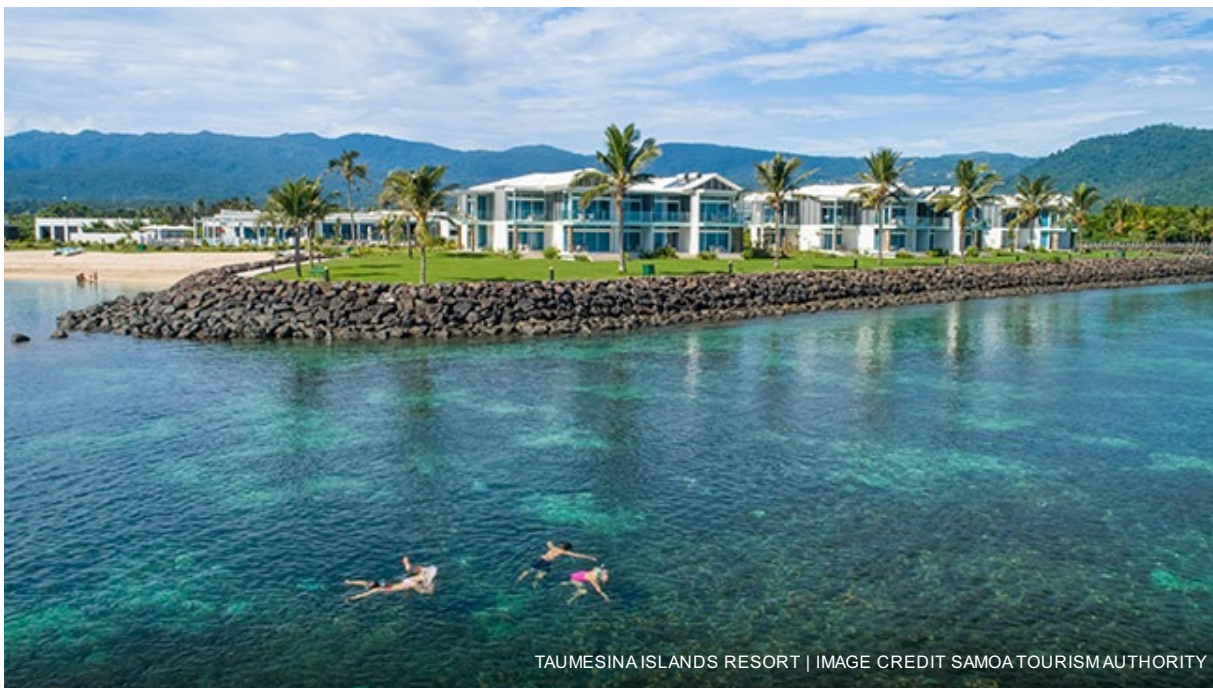
TAUMESINA ISLANDS RESORT

Overnight stay at Taumeasina Island Resort in a Oceanview King Room.