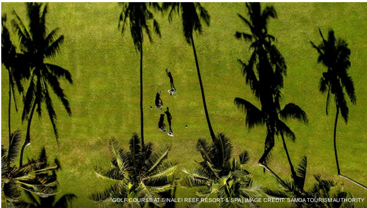
GOLF COURSE AT SINALEI REEF RESORT & SPA

Overnight stay at Sinalei Reef Resort & Spa in a Traditional Garden View Villa.