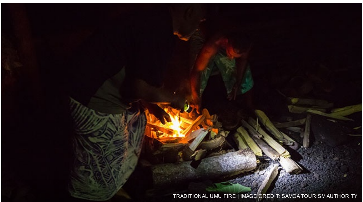
TRADITIONAL UMU FIRE