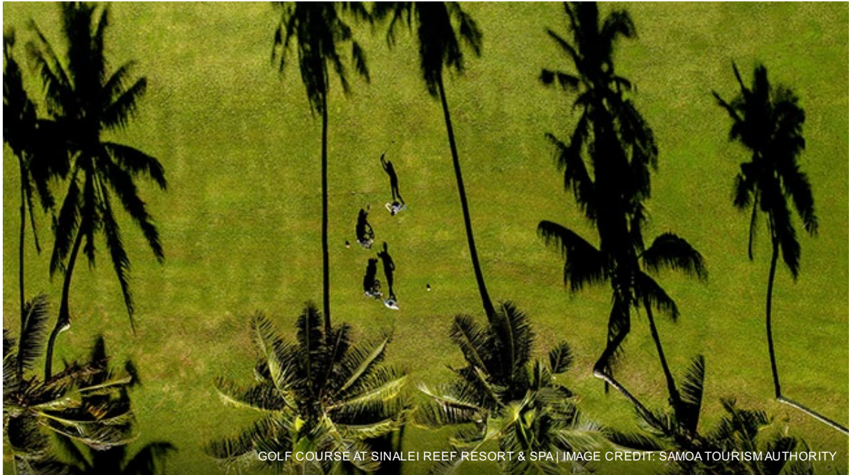
GOLF COURSE AT SINALEI REEF RESORT & SPA

Overnight stay at Sinalei Reef Resort & Spa in a Traditional Garden View Villa.