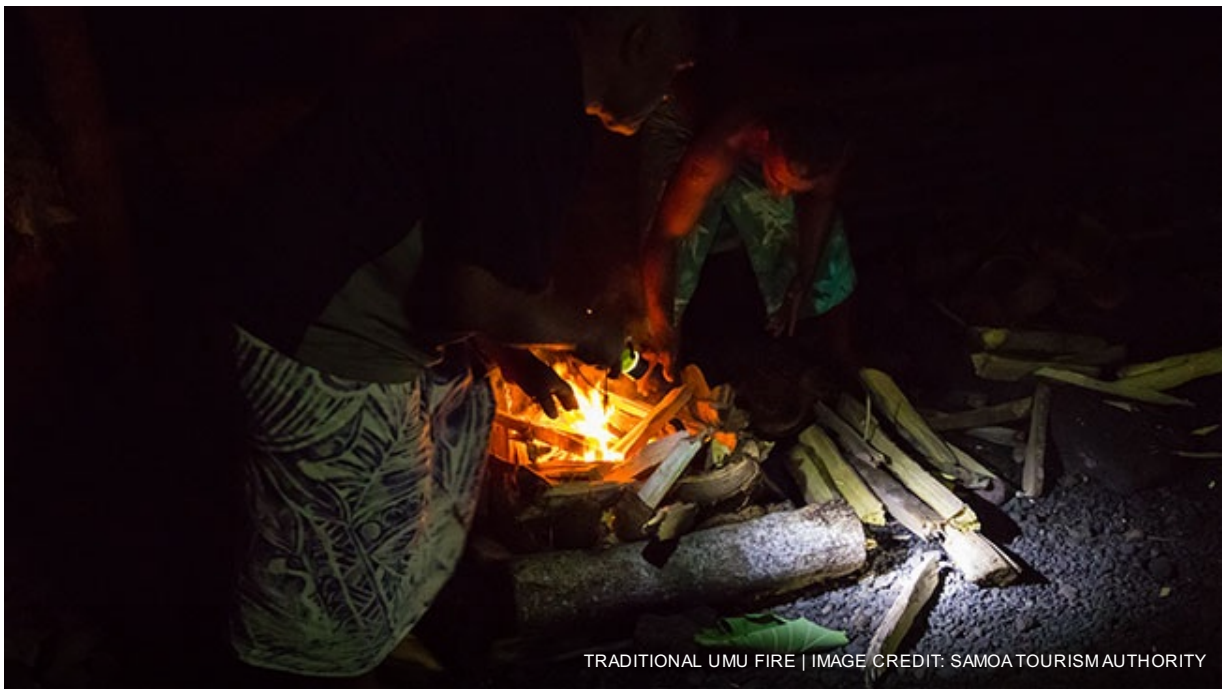
TRADITIONAL UMU FIRE