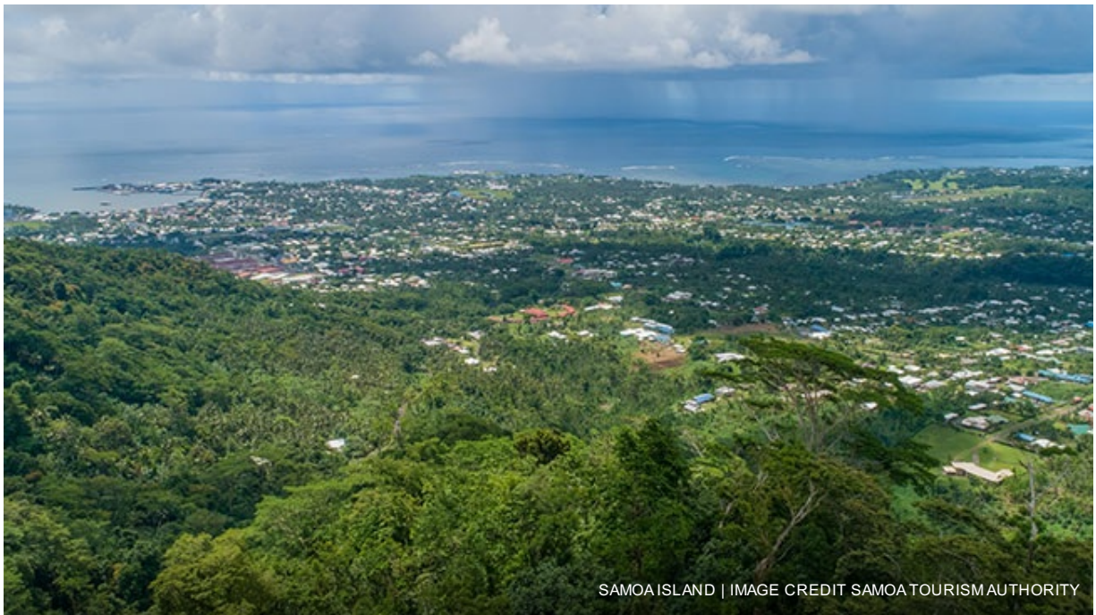
SAMOA ISLAND