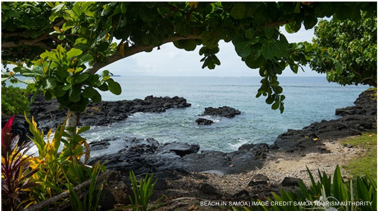
BEACH IN SAMOA