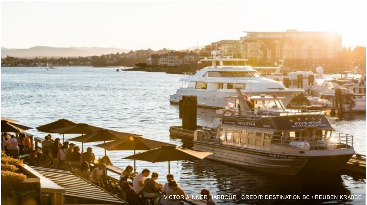
VICTORIA INNER HARBOUR

Overnight in Victoria at Inn at Laurel Point