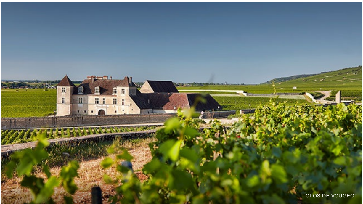
CLOS DE VOUGEOT