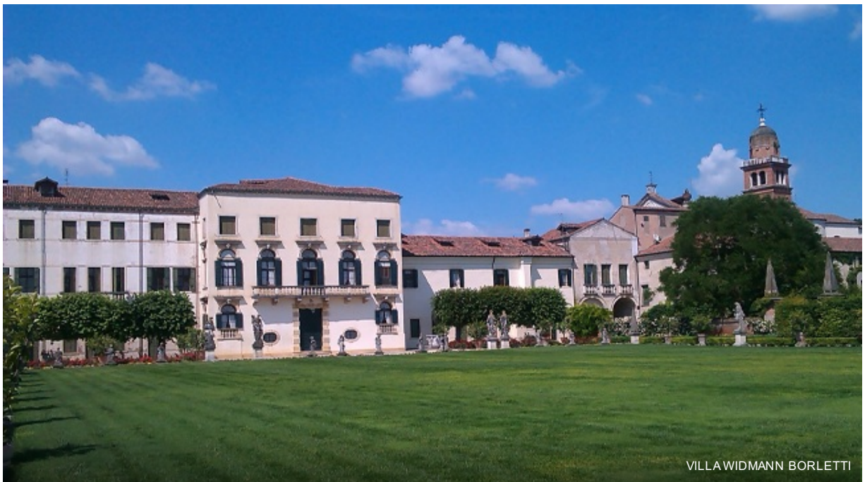
VILLA WIDMANN BORLETTI