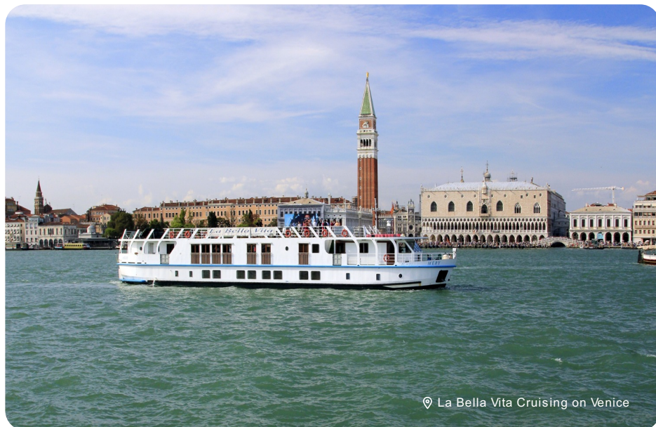
La Bella Vita Cruising on Venice