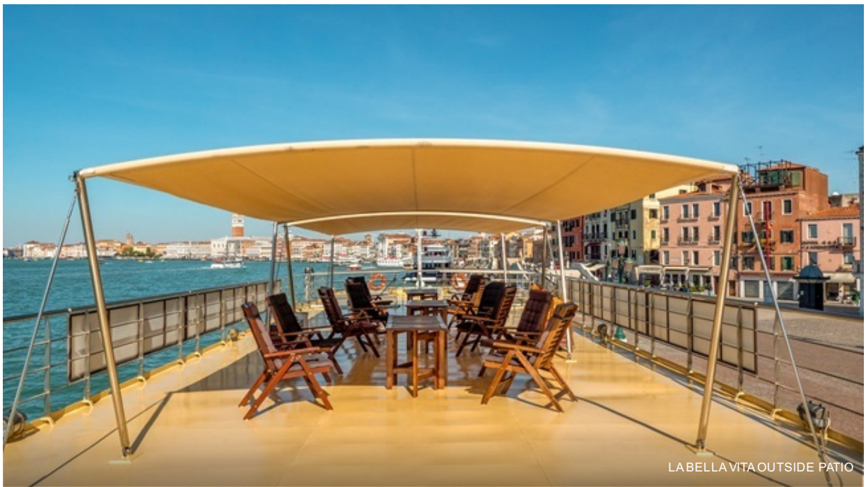
LA BELLA VITA OUTSIDE PATIO