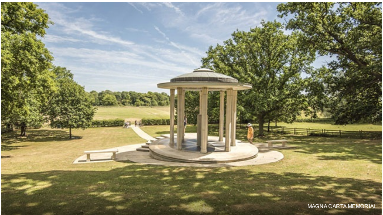
MAGNA CARTA MEMORIAL