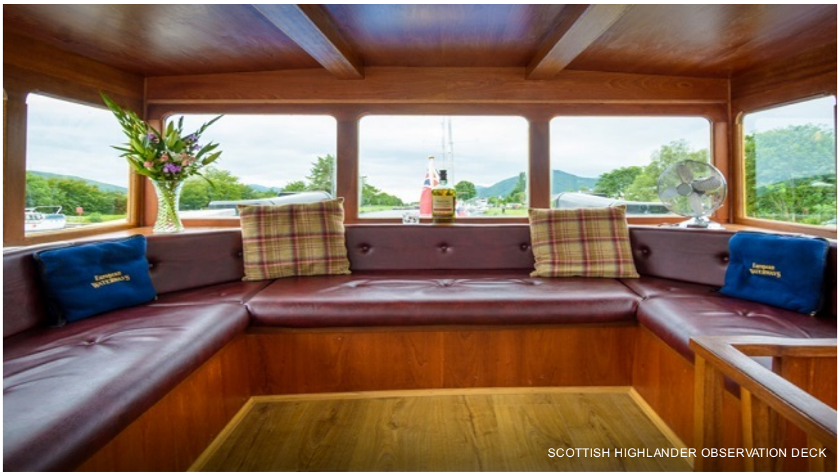
SCOTTISH HIGHLANDER OBSERVATION DECK